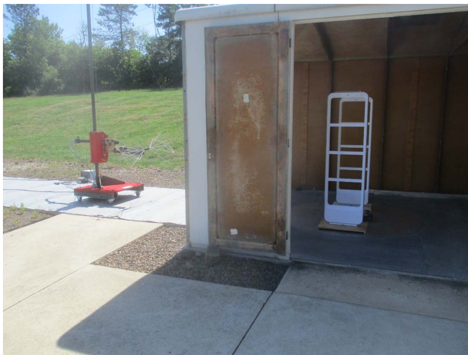
Horizontal Antenna Polarization, 30 to 200 MHz