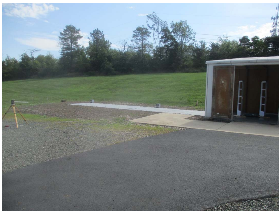
Parallel to Ground