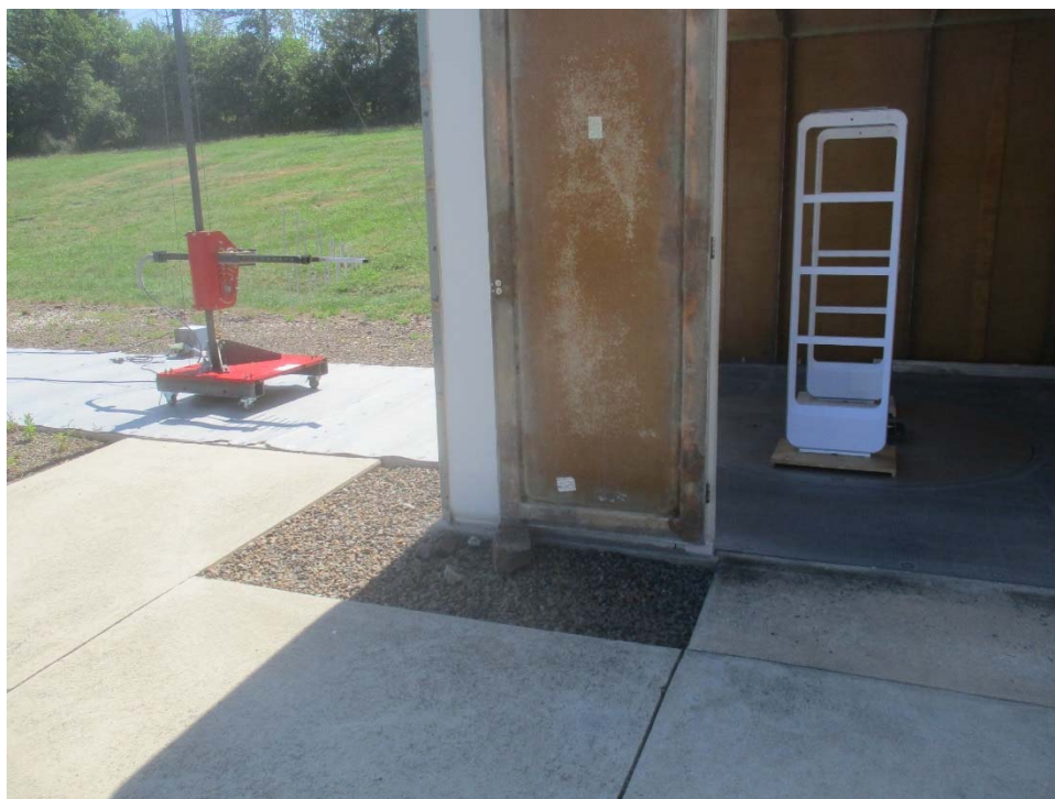
Vertical Antenna Polarization, 200 to 1000 MHz