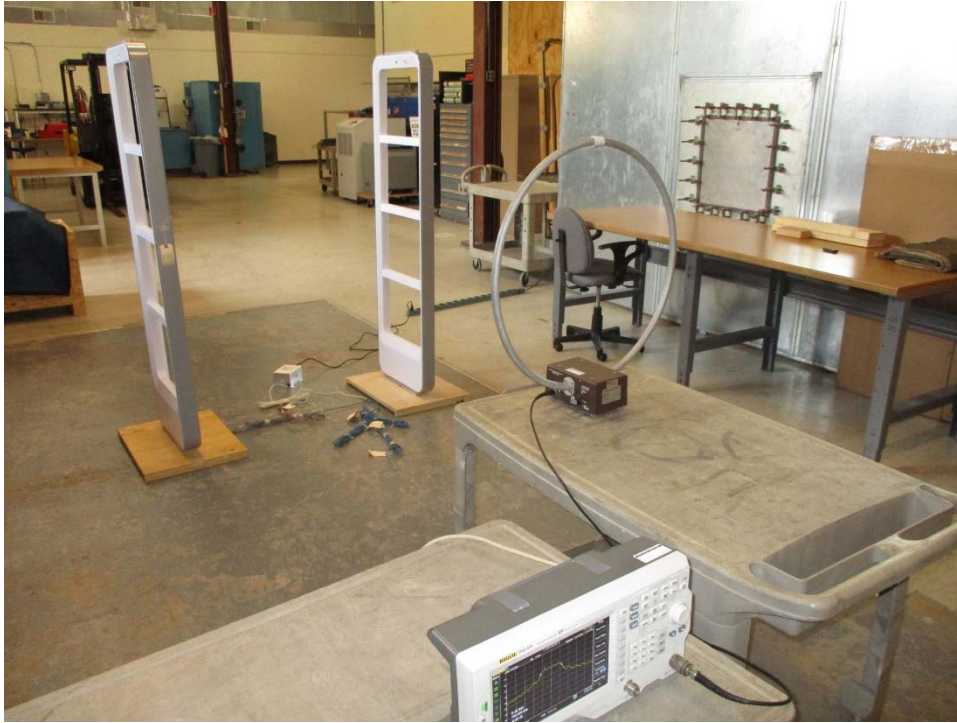
6 dB Bandwidth, Test Setup