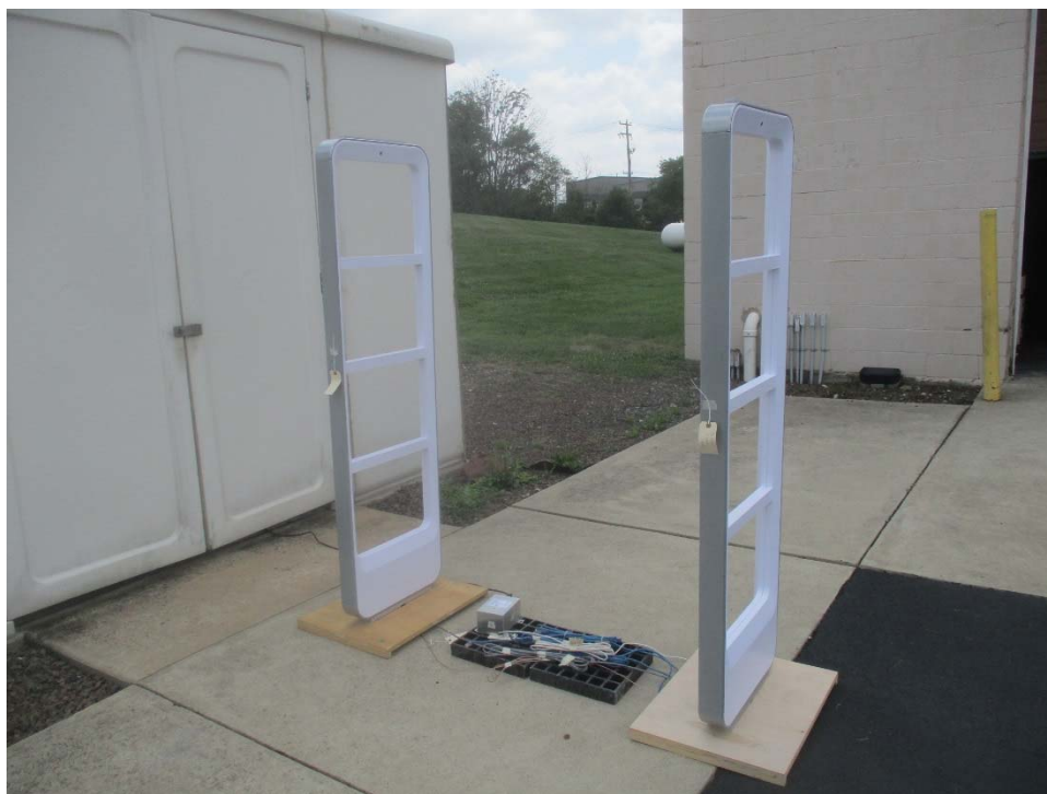
EUT Configuration, below 30 MHz