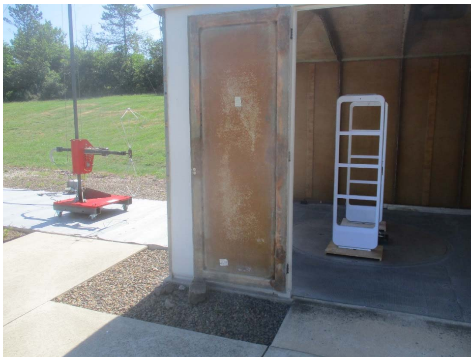
Vertical Antenna Polarization, 30 to 200 MHz