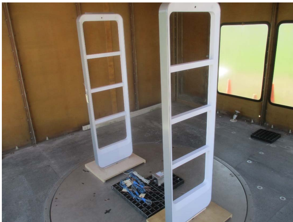
EUT Configuration, Above 30 MHz