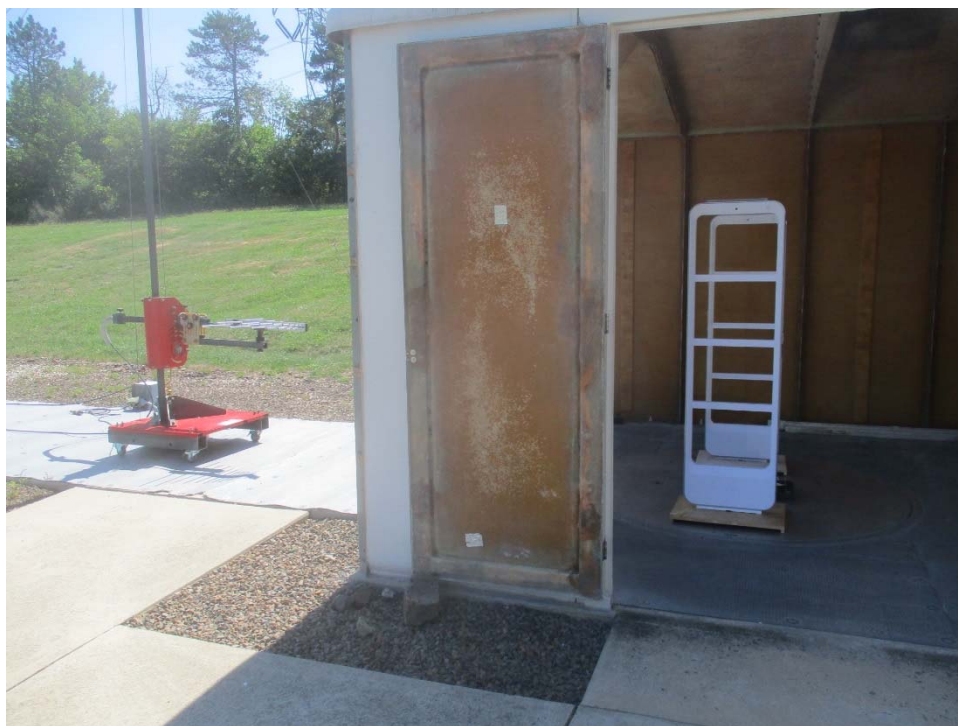
Horizontal Antenna Polarization, 200 to 1000 MHz