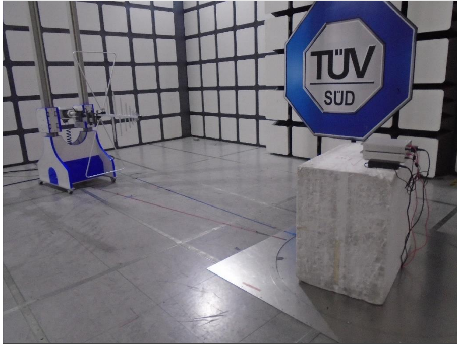
Figure 1 – Radiated Disturbance - 30 MHz to 1 GHz