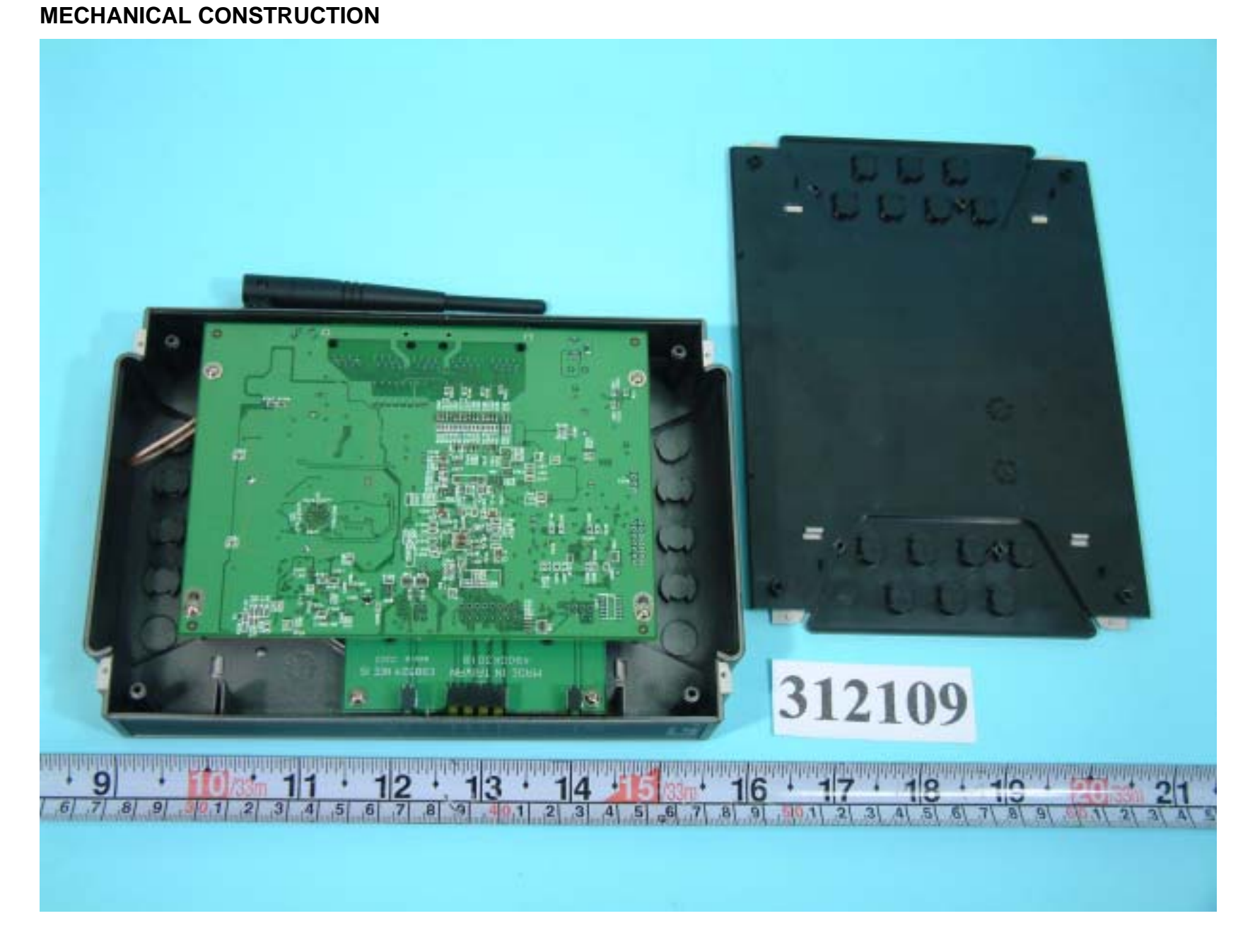
FCC ID: P270K3A Number 1