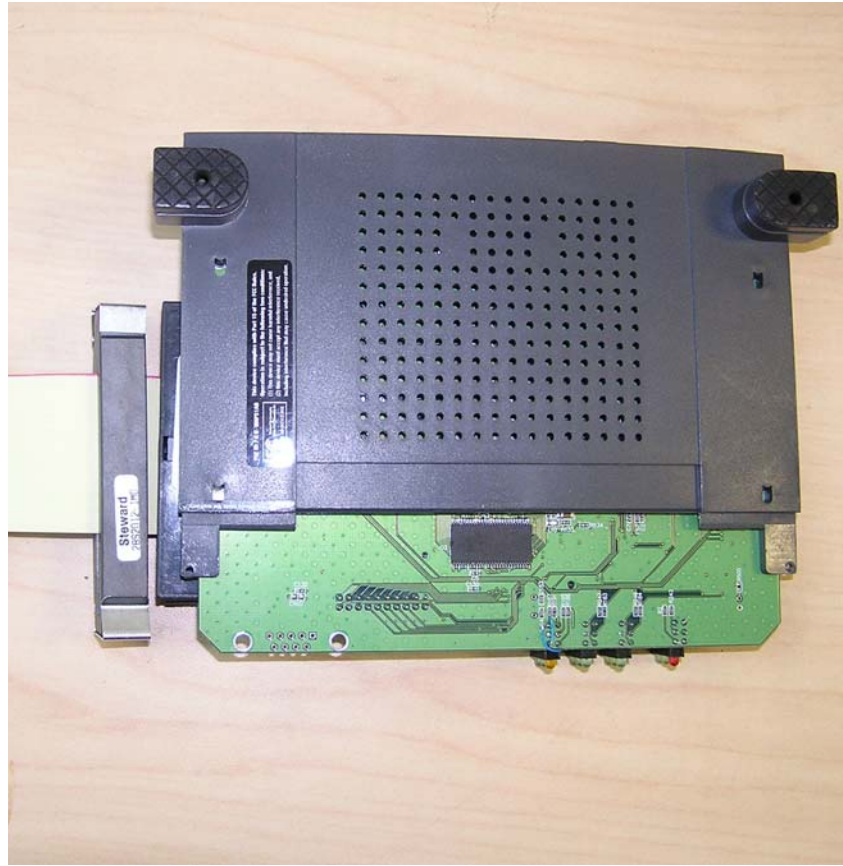
Test fixture with WLAN bottom