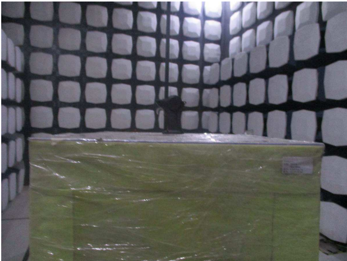
Above 1GHz (EUT was placed in the centre of the turntable)