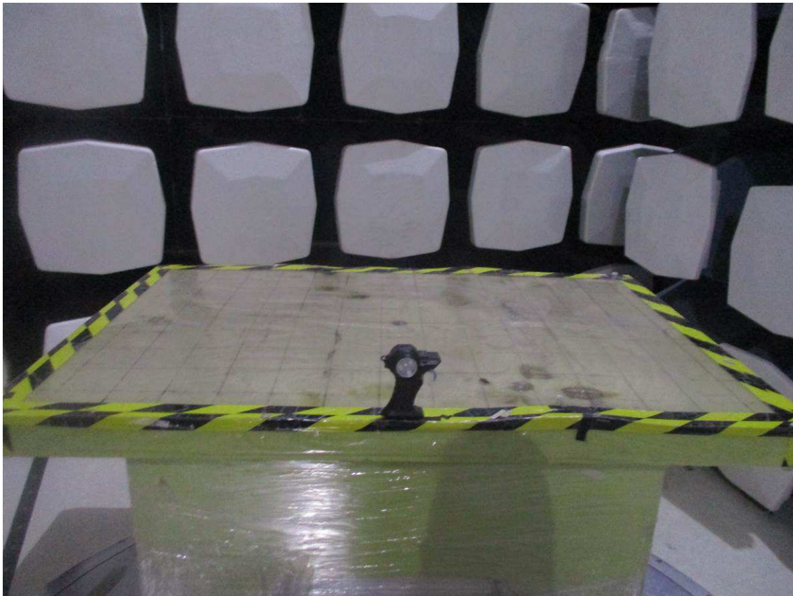
Up to 1GHz (EUT was placed in the centre of the turntable)