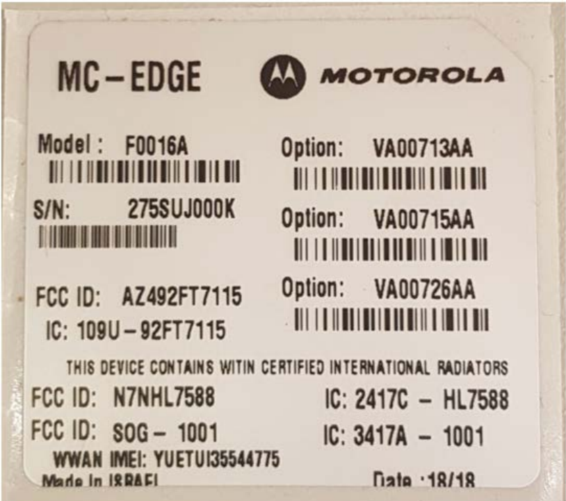
EXHIBIT 1D – FCC/IC Label for APX4000 7/800 for MC-EDGE with LTE and LoRA Options