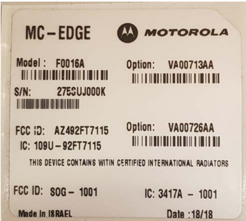
EXHIBIT 1C – FCC/IC Label for APX4000 7/800 For MC-EDGE with LoRA Options