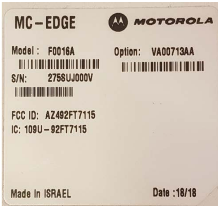
EXHIBIT 1A – FCC/IC Label for APX4000 7/800 for MC-EDGE