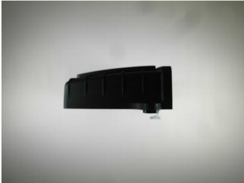
Photo 5 DUT side view