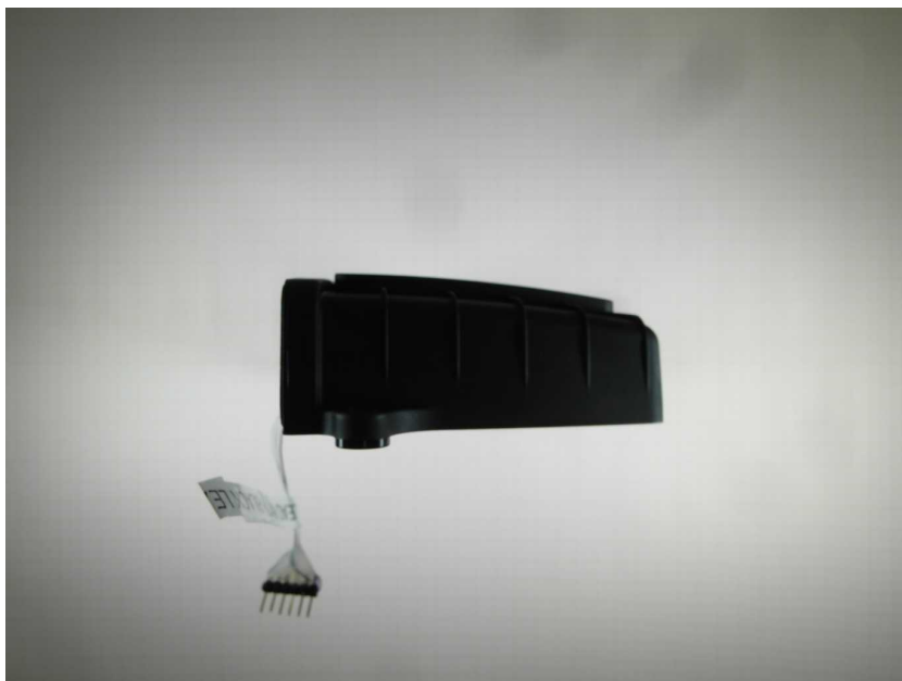
Photo 6 DUT side view