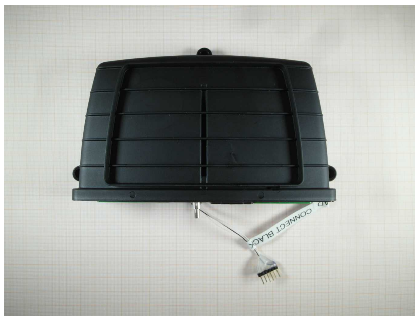
Photo 4 DUT side view