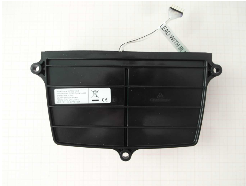
Photo 3 DUT side view