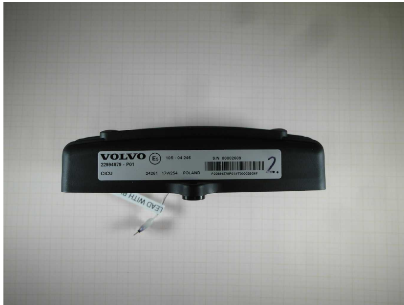
Photo 1 DUT front view