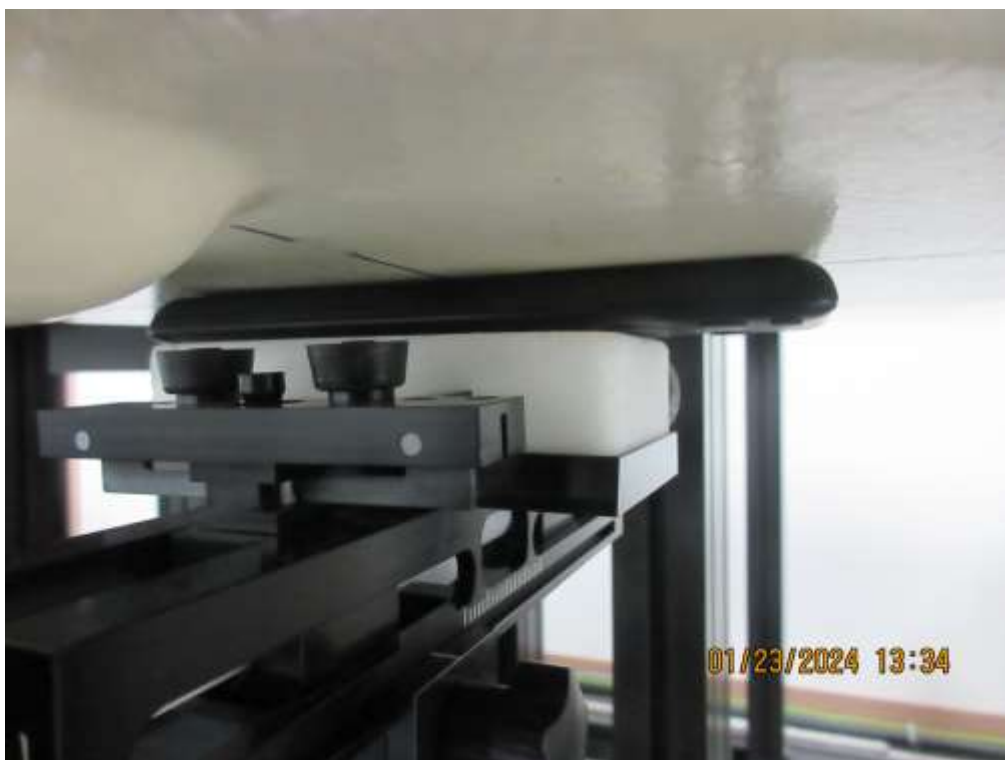
Rear from SAM(Flat) Phantom (Separation Distance: 0 cm)

This Report is not correlated with the authentication of KOLAS.