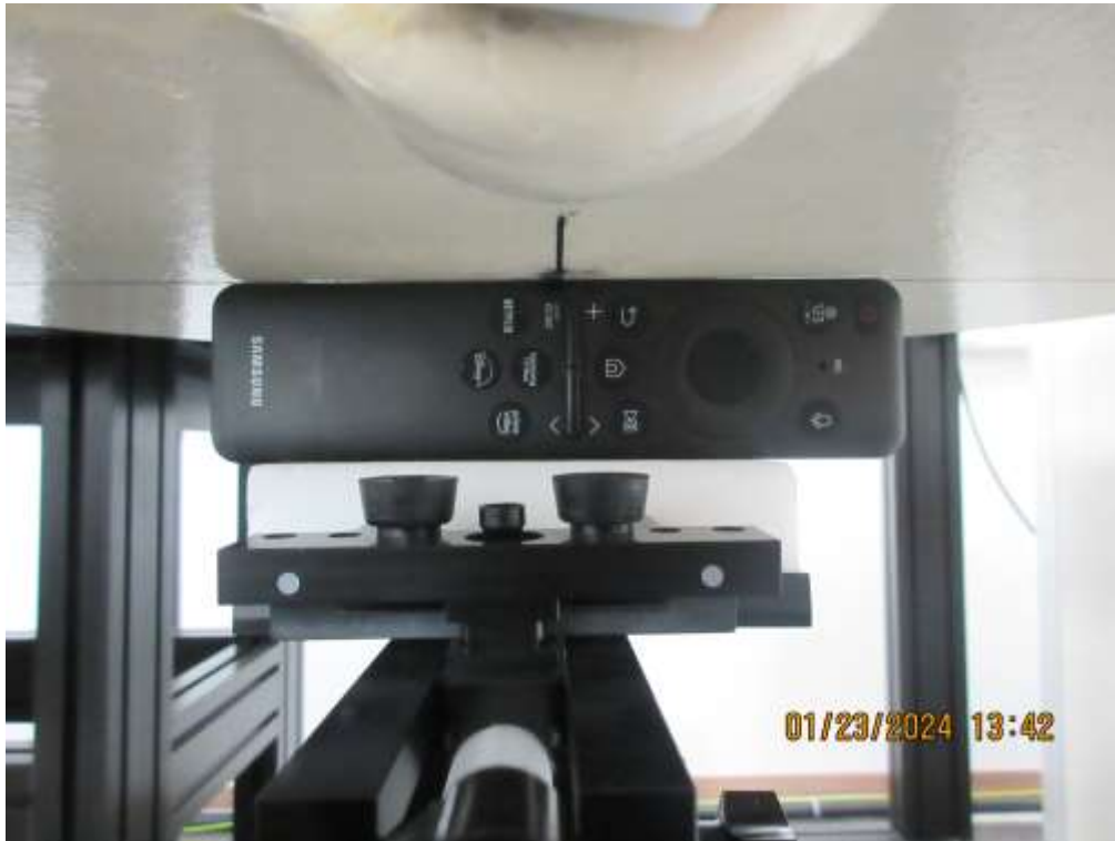
Left from SAM(Flat) Phantom (Separation Distance: 0 cm)