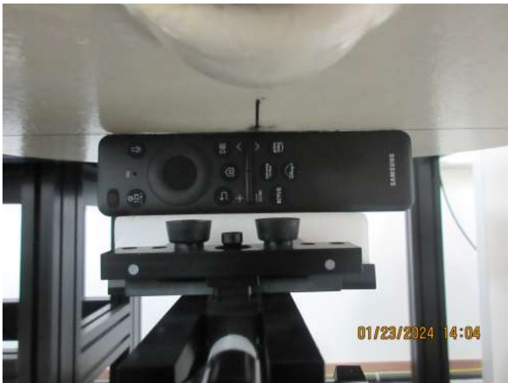
Right from SAM(Flat) Phantom (Separation Distance: 0 cm)