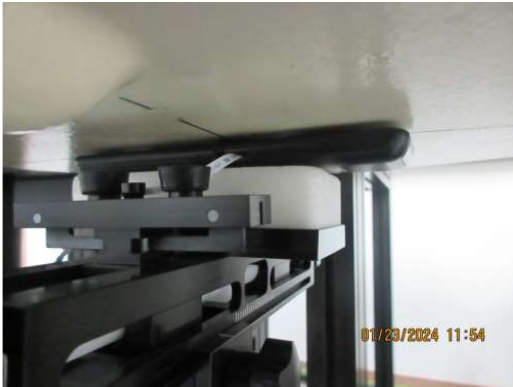
Front from SAM(Flat) Phantom (Separation Distance: 0 cm)