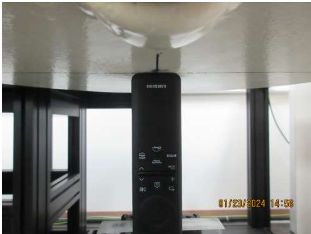
Bottom from SAM(Flat) Phantom (Separation Distance: 0 cm)