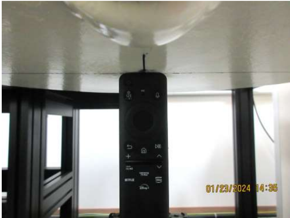
Top from SAM(Flat) Phantom (Separation Distance: 0 cm)