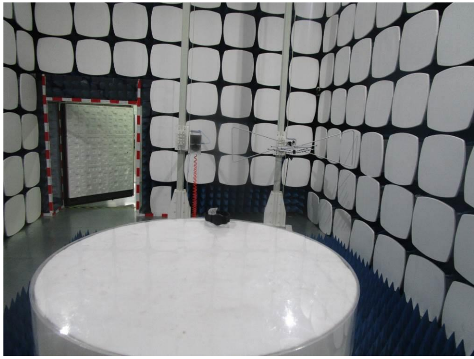
Radiated Spurious Emissions (Below 1GHz)

Radiated Emissions which fall in the restricted bands