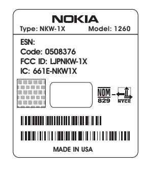
Exhibit 1: Type Label