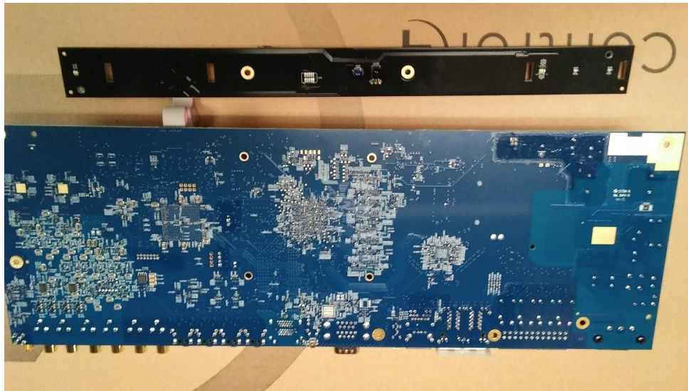
Photograph 2 – View of the Bottom Side of the PCB