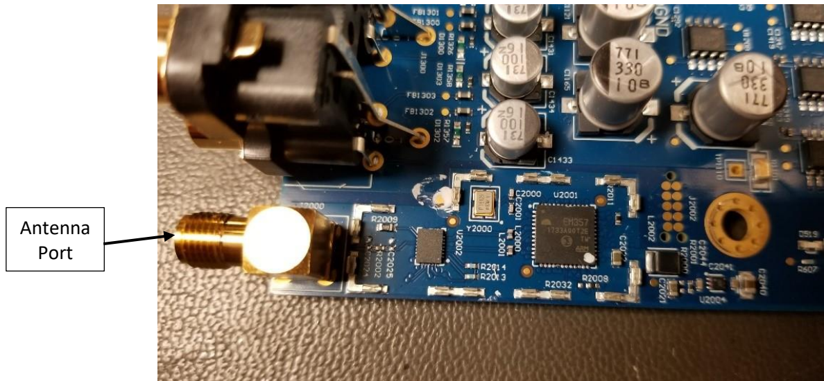
Photograph 3 – View of the Circuitry under the RF Shield