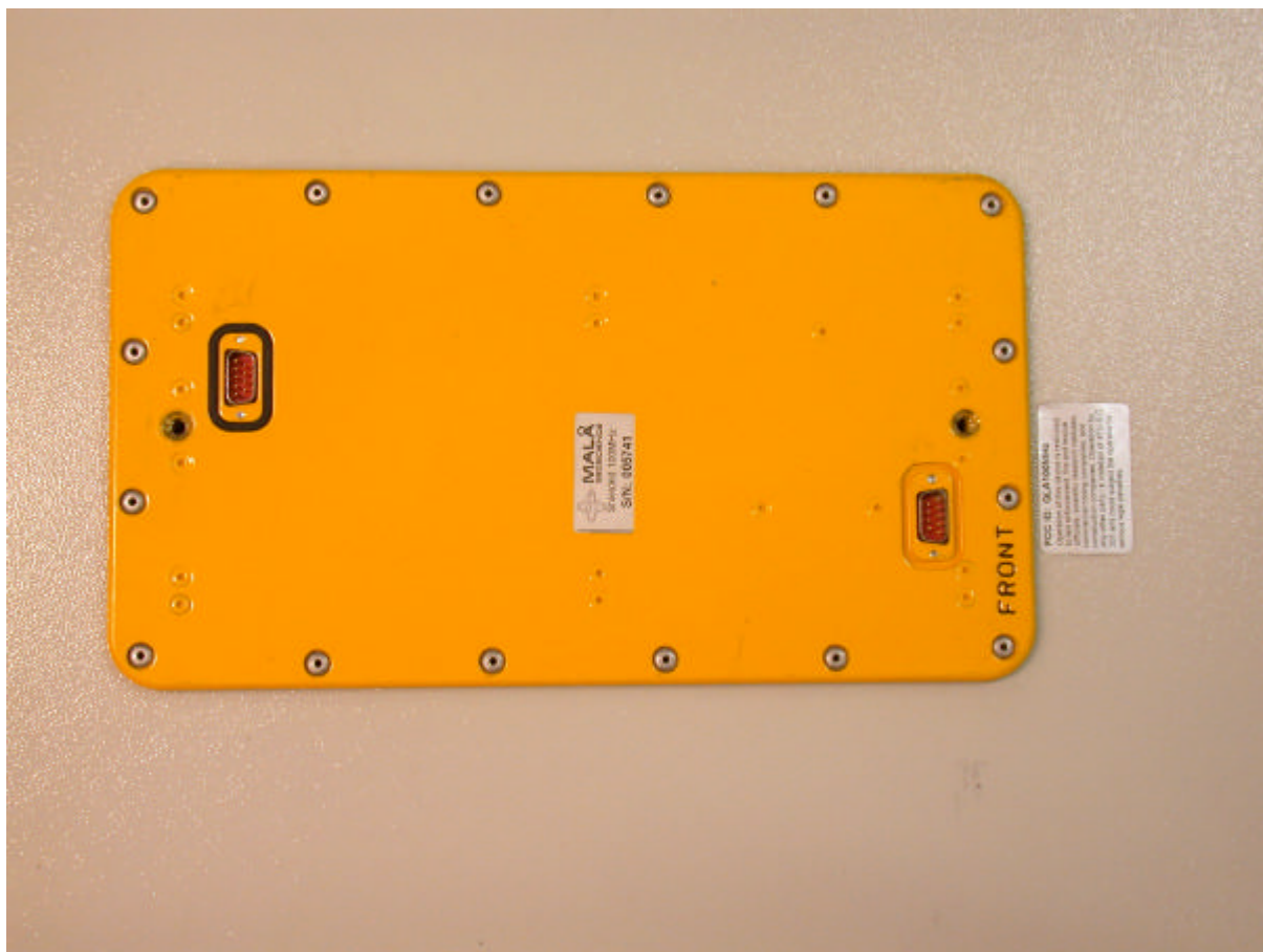
Figure 3. Photo showing label location in detail.