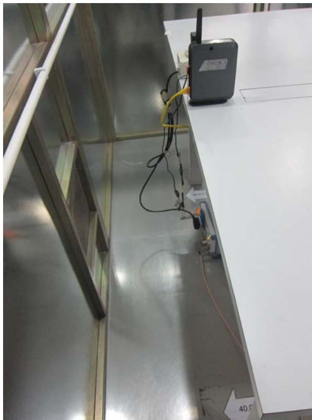
Side View 1

Test Report Number: 17081471HKG-001 FCC ID: EW780-1363-00 IC: 1135B-80136300