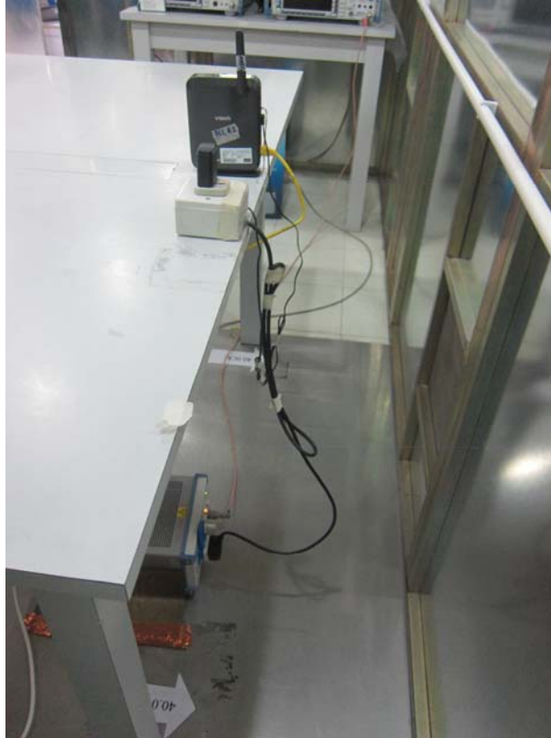
Side View 2