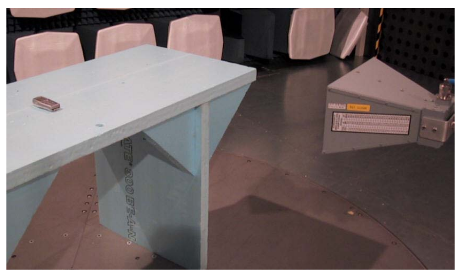
Picture 4: Radiated spurious emission measurement set-up for above 3 GHz measurements, EUT in horizontal orientation