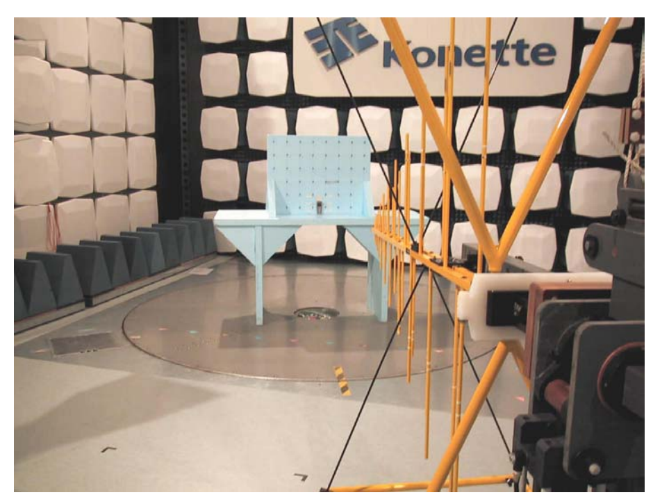
Picture 3: Radiated spurious emission measurement set-up for below 3 GHz measurements, EUT in vertical orientation