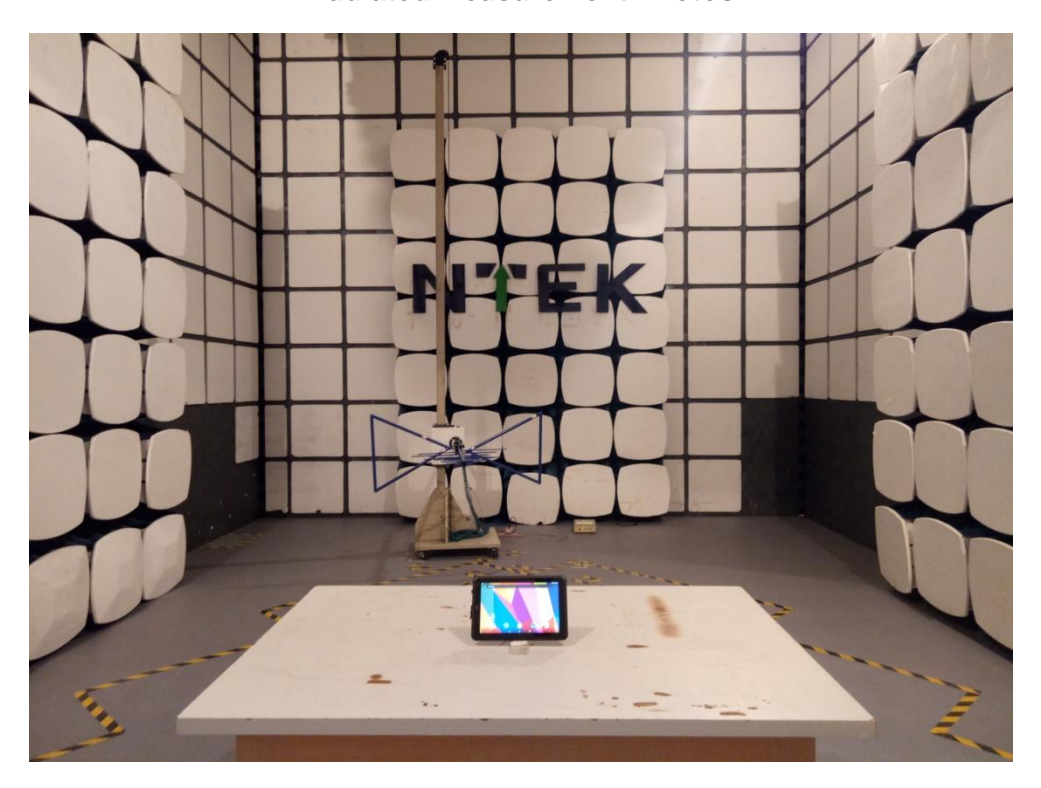
Radiated Measurement Photos