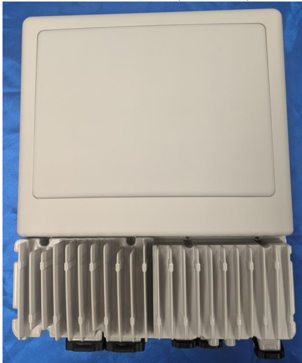
Front View AWEUC/D (Base Unit)