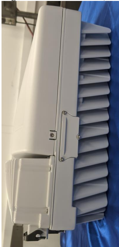
Right Side AWEUC/D (Base Unit)