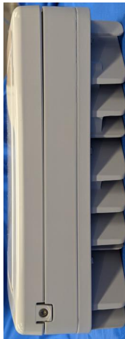
Right Side FA3UA (Extension Module)