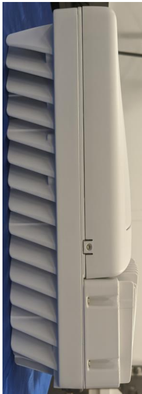
Left Side AWEUC/D (Base Unit)