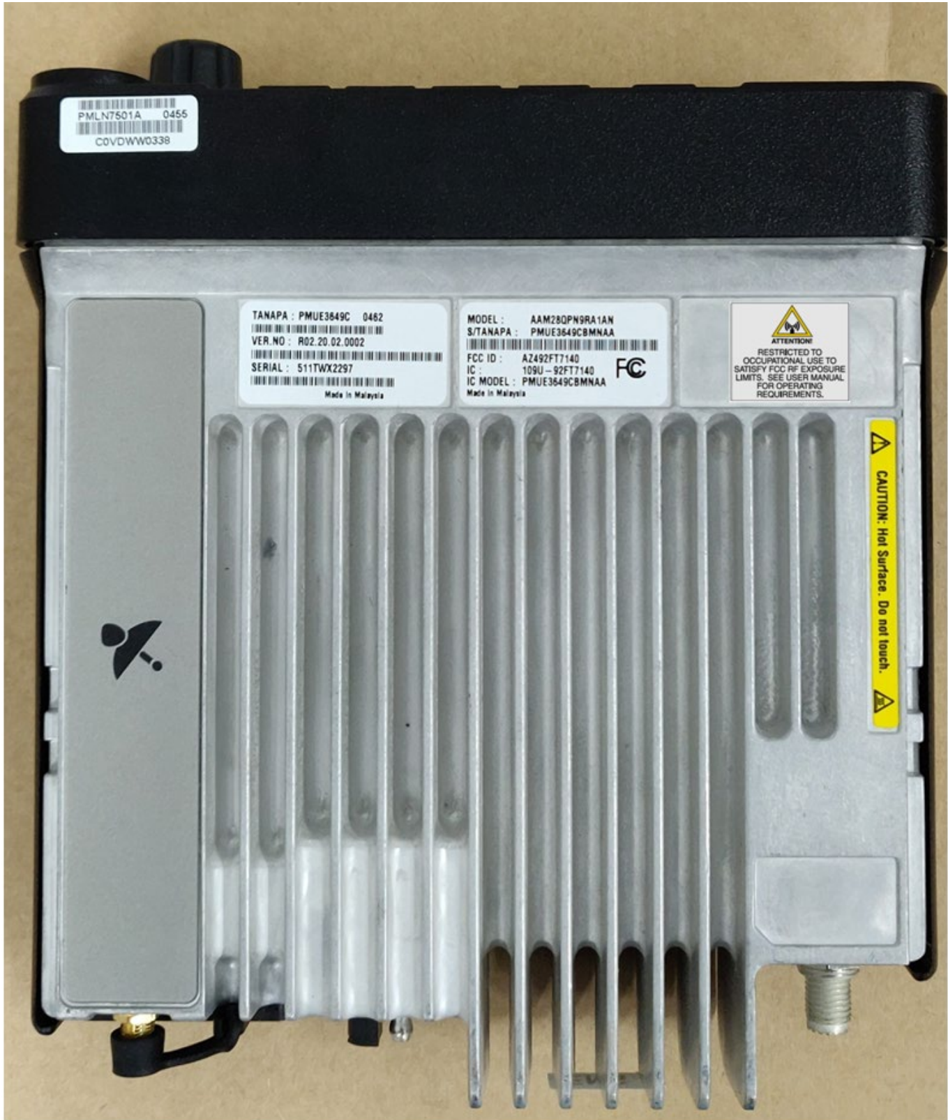
Bottom View (FCC/IC Label Location) Same for XPR 5550e Color Display and XPR 5350e Numeric Display