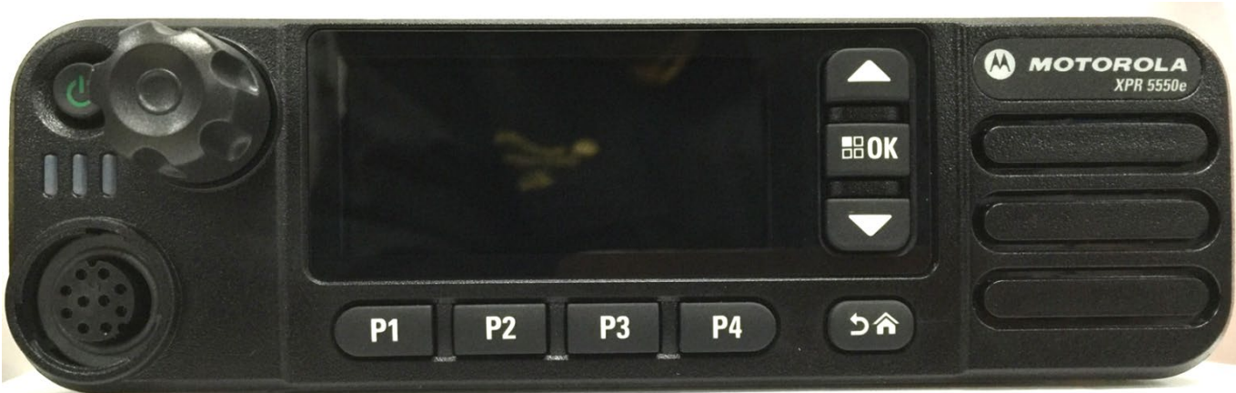
Front View (XPR 5550e - Color Display)