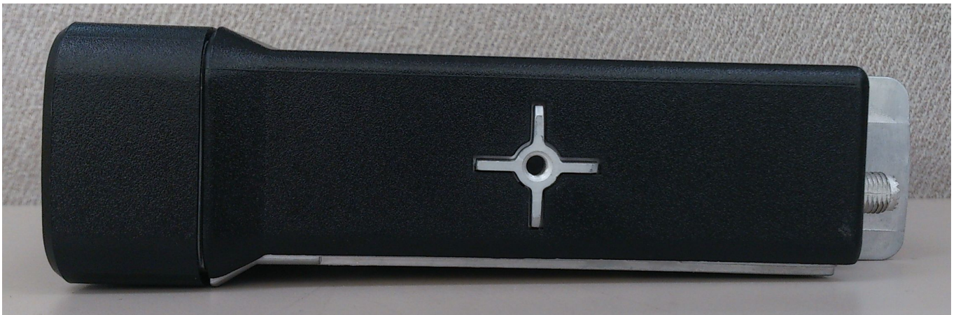
Side View (Right) – Same for XPR 5550e Color Display and XPR 5350e Numeric Display