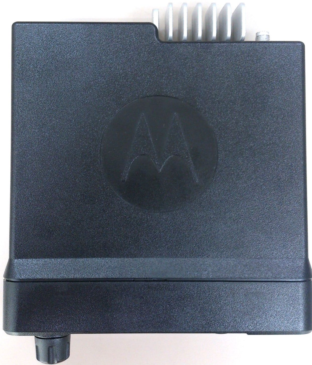
Top View (Same for XPR 5550e Color Display and XPR 5350e Numeric Display)