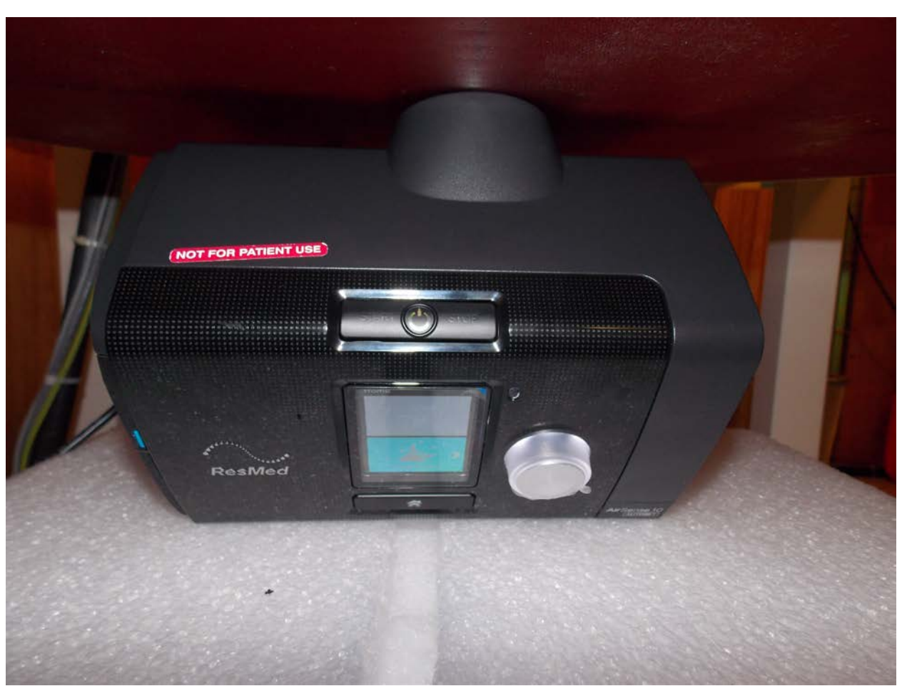
Test Position Back 0 mm Gap