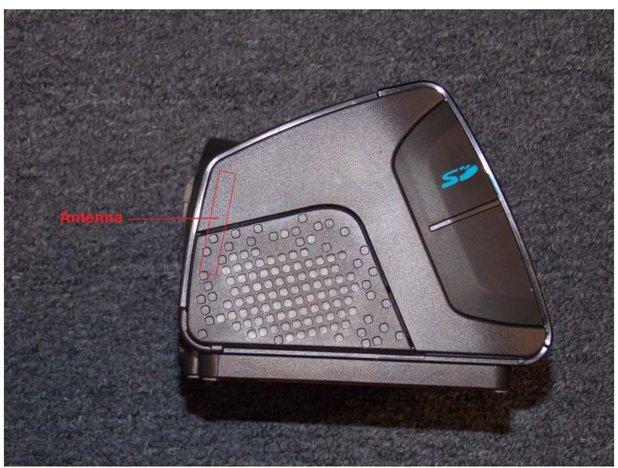
Antenna Location on End