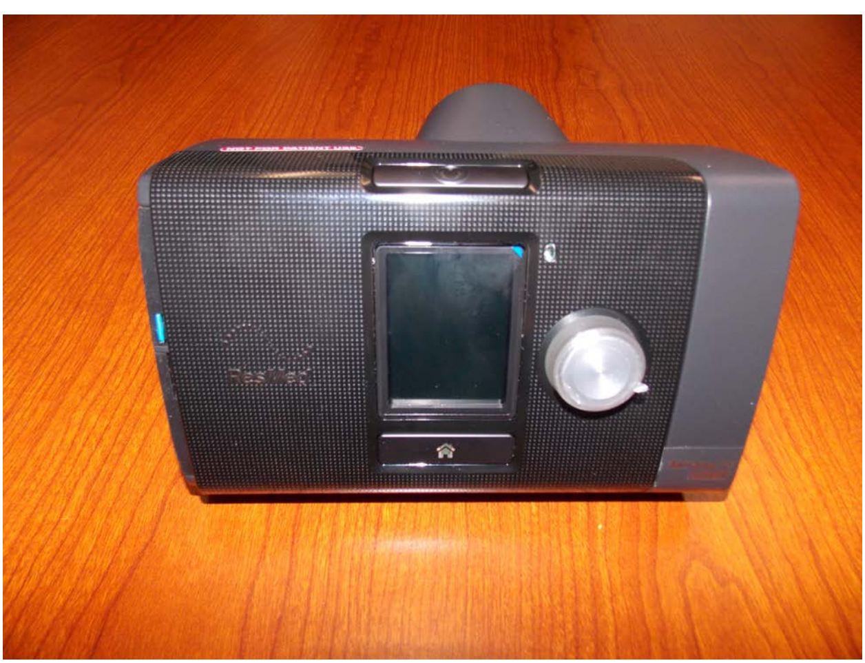
Front of Device