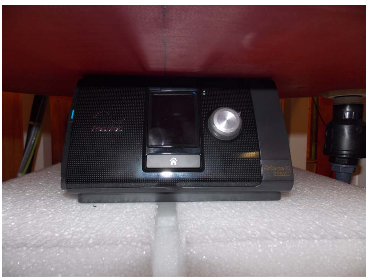
Test Position Top 0 mm Gap