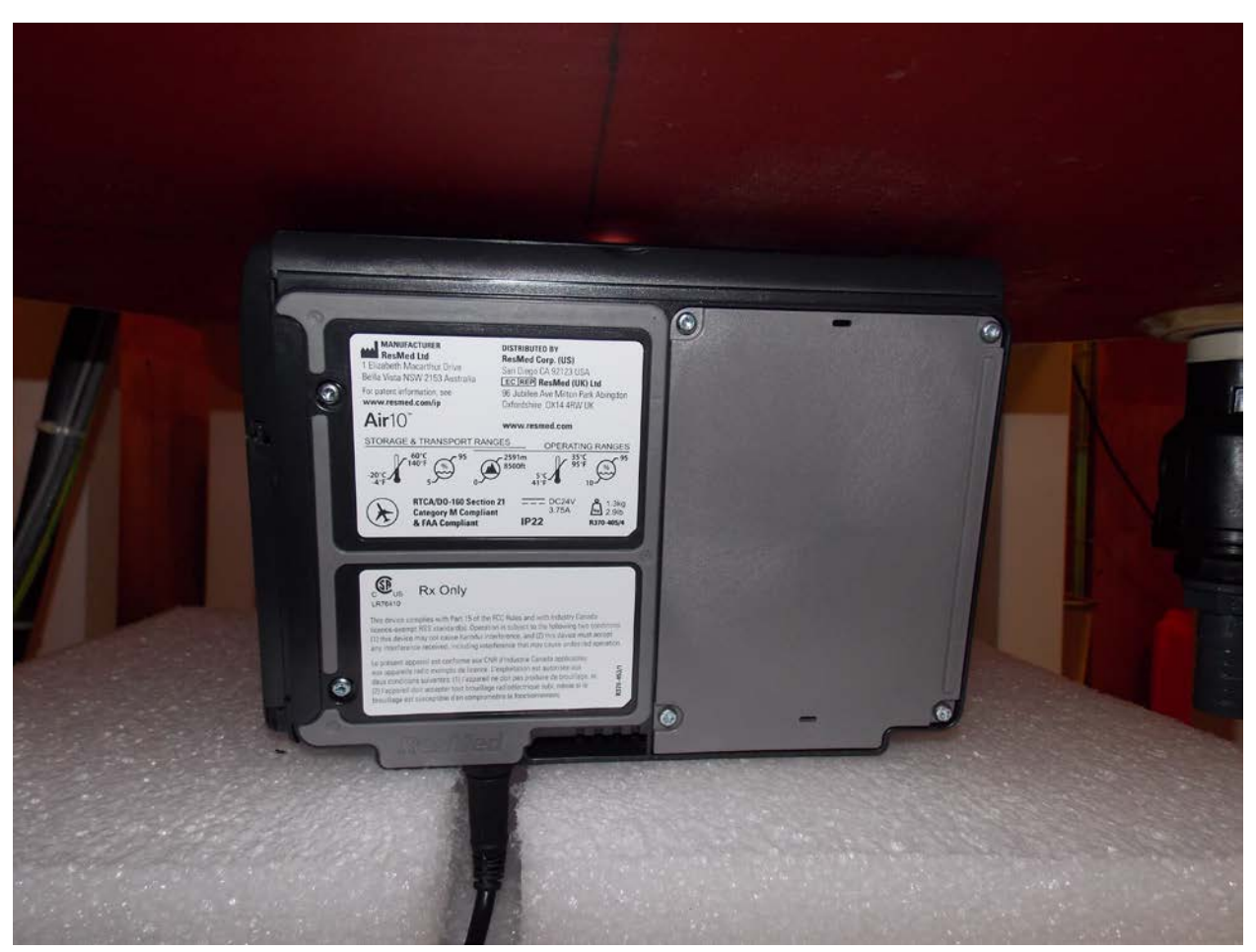
Test Position Front 0 mm Gap