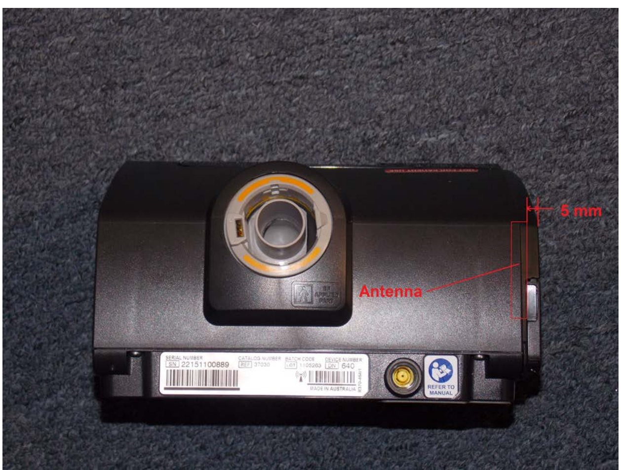
Antenna Location on Back & Distance to End