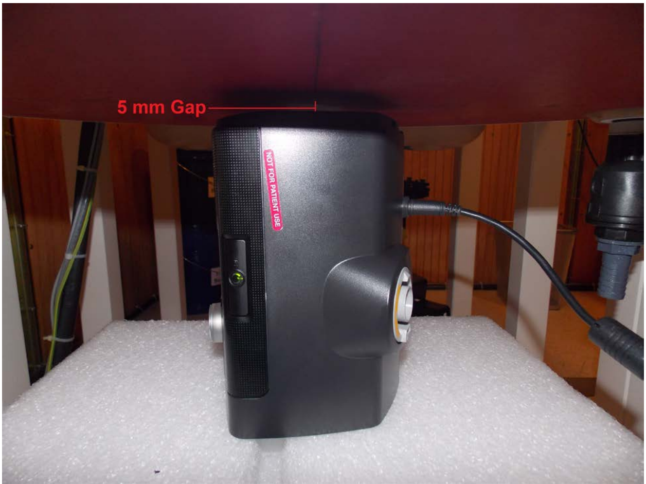
Test Position End 5 mm Gap