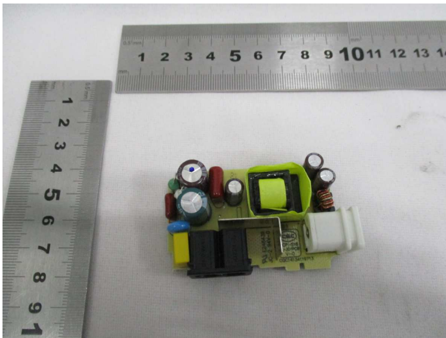
PCB of LED driver