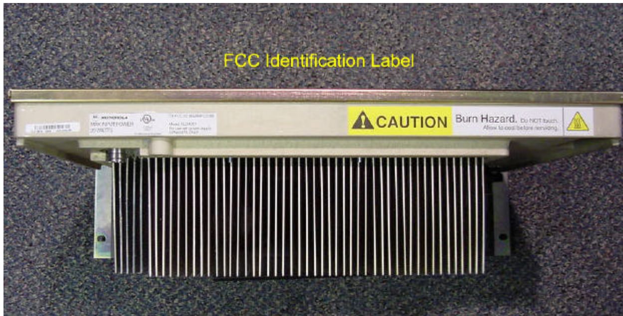
Rear of Booster Amp Including Location of the FCC ID Label