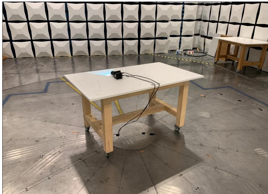
Radiated emissions 30 MHz – 1 GHz