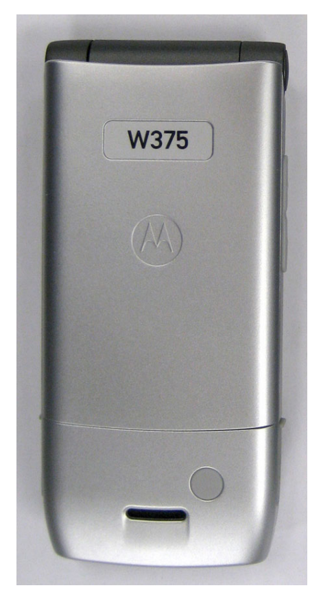
BACK OF PHONE