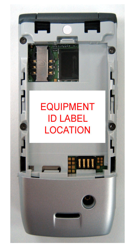
BACK OF PHONE WITH BATTERY COVER REMOVED