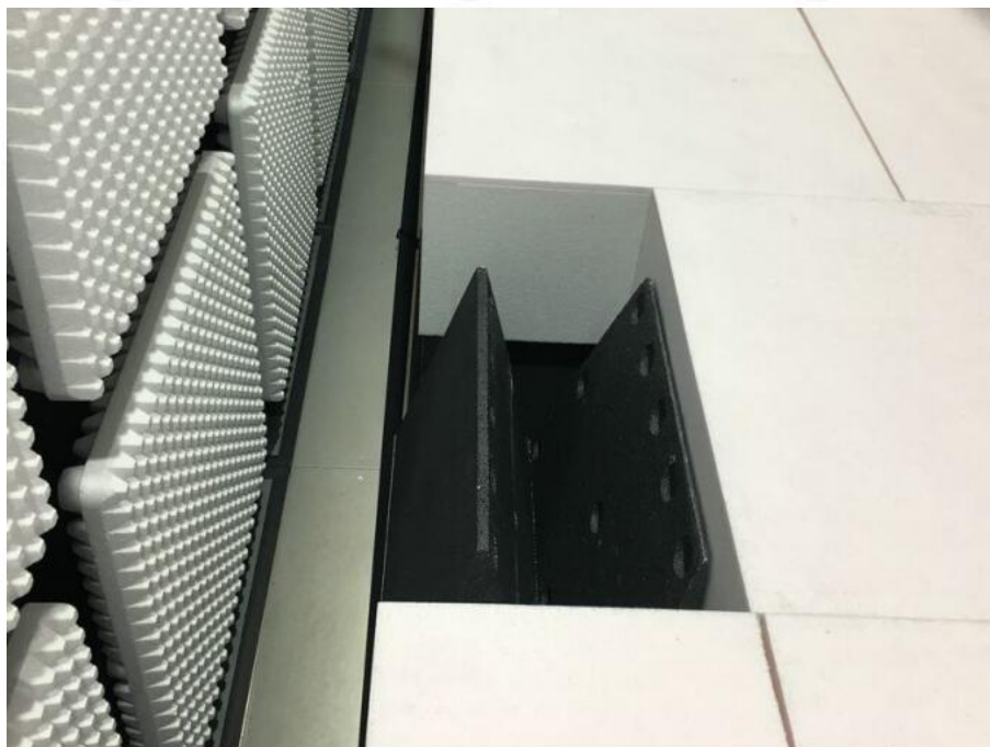
Radiated spurious emission Test Setup-3 (Above 1GHz) There are absorbing materials under the ground.