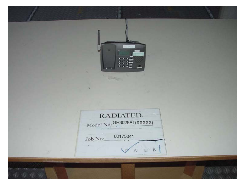
Radiated Emission – Base