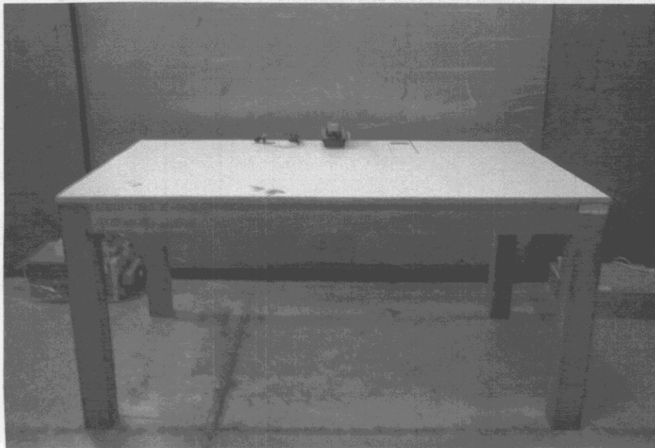
Fig. 1 Conducted Emissions Test Configuration (Idle only)