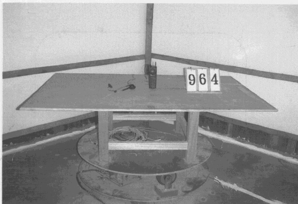
Pic 1 Front View of the Test Configuration (HANDSET)