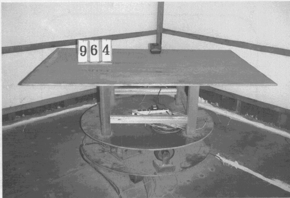
Pic 1 Front View of the Test Configuration ( BASE )