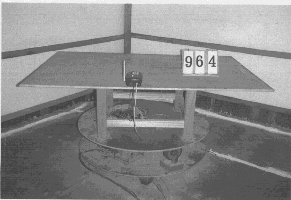
Pic 2 Rear View of the Test Configuration ( BASE )