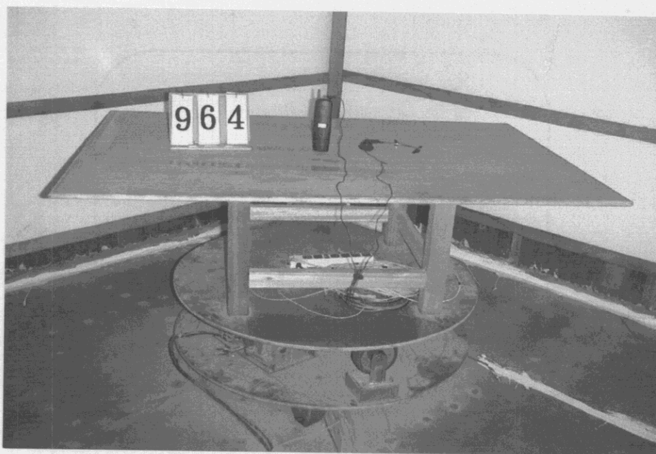
Pic 2 Rear View of the Test Configuration (HANDSET)

The test configuration for frequency between 1 GHz to 18 GHz is same as above.