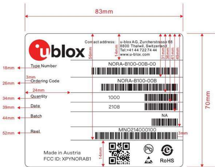
Figure 4: NORA-B1 series batch label