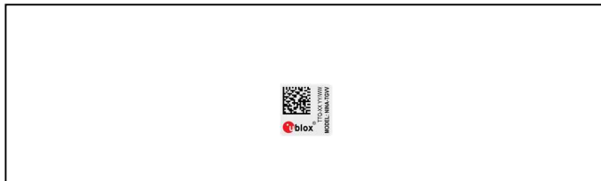
Figure 2: Actual size of the NORA-B100, NORA-B101, NORA-B106 identifier marking (8 x 8 mm)

The modules are SMT components shipped to the OEM-integrator on Tape&Reel packed in a sealed Dry-Pac bag and mounted onto the host board by automatic “Pick&Place” machines. As the module is a surface mount device that is soldered onto the host it is not possible to place the label on the secondary side of the module.