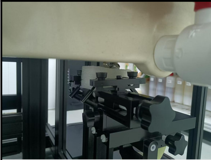
Inside of Left Earphone with 0 cm Gap