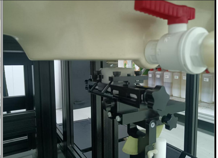
Right Side of Right Earphone with 0 cm Gap