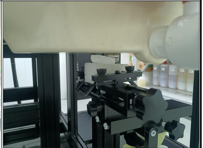
Right Side of Left Earphone with 0 cm Gap