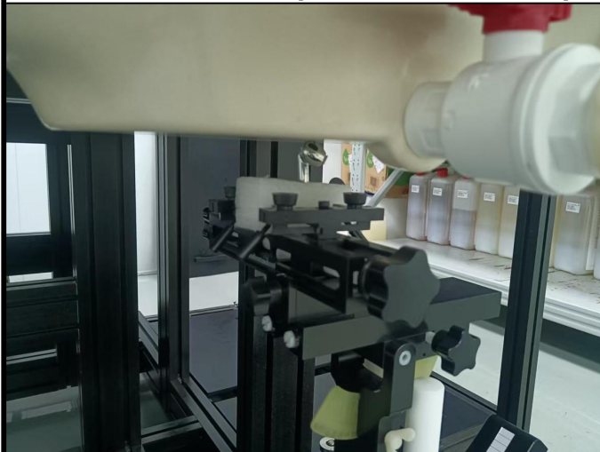
Top Side of Left Earphone with 0 cm Gap