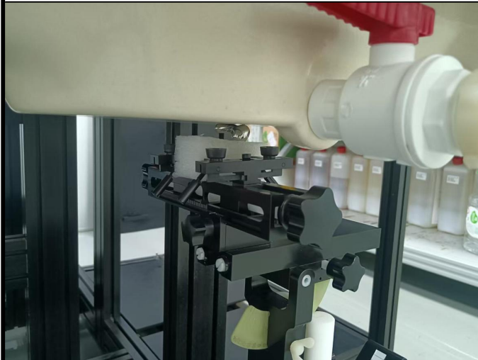
Left Side of Left Earphone with 0 cm Gap