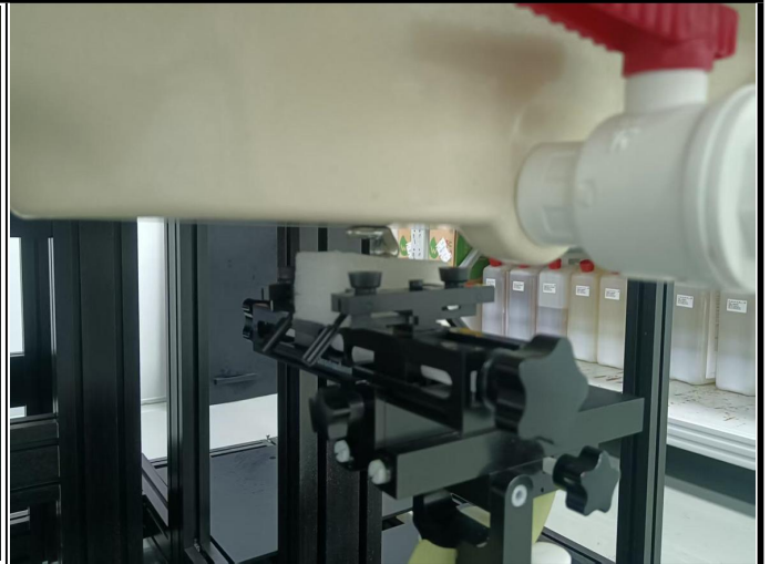
Rear Face of Right Earphone with 0 cm Gap