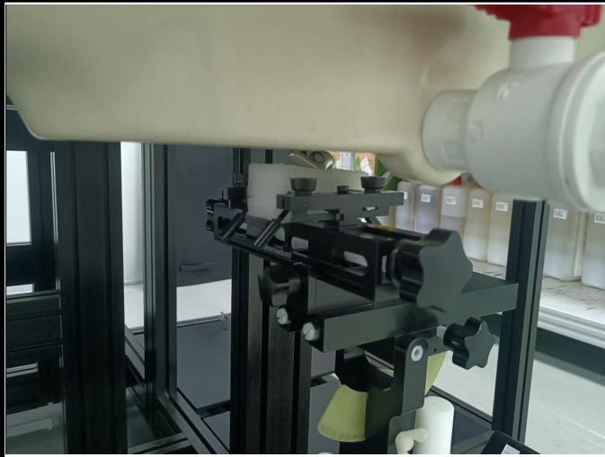
Inside of Right Earphone with 0 cm Gap