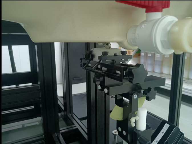
Left Side of Right Earphone with 0 cm Gap