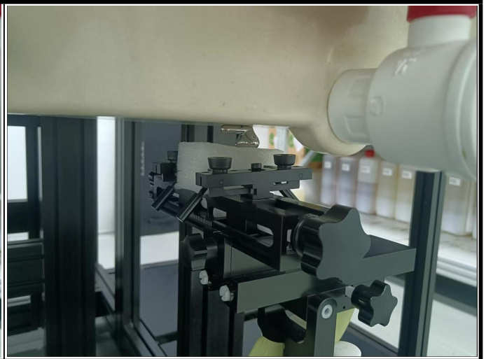
Rear Face of Left Earphone with 0 cm Gap