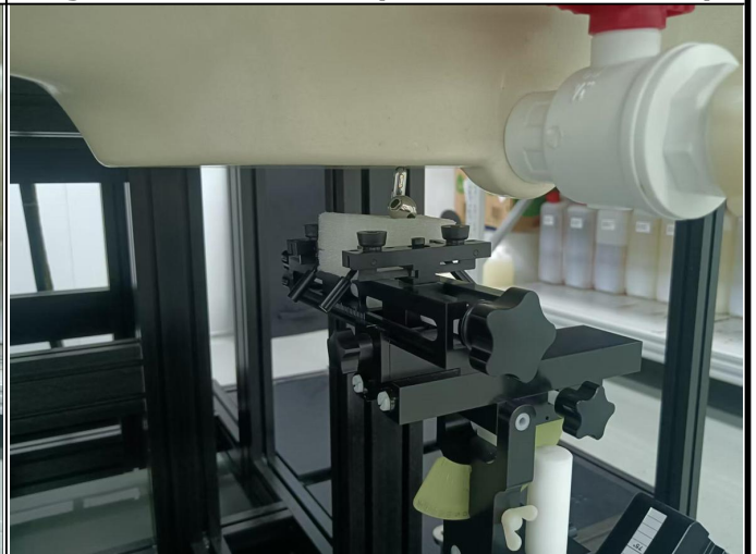
Bottom Side of Left Earphone with 0 cm Gap