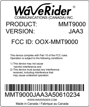
Label Artwork and Variables Actual Size when printed to scale