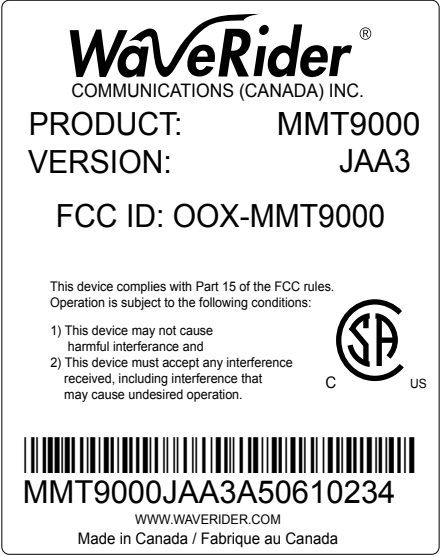
Thermal Printed Variables