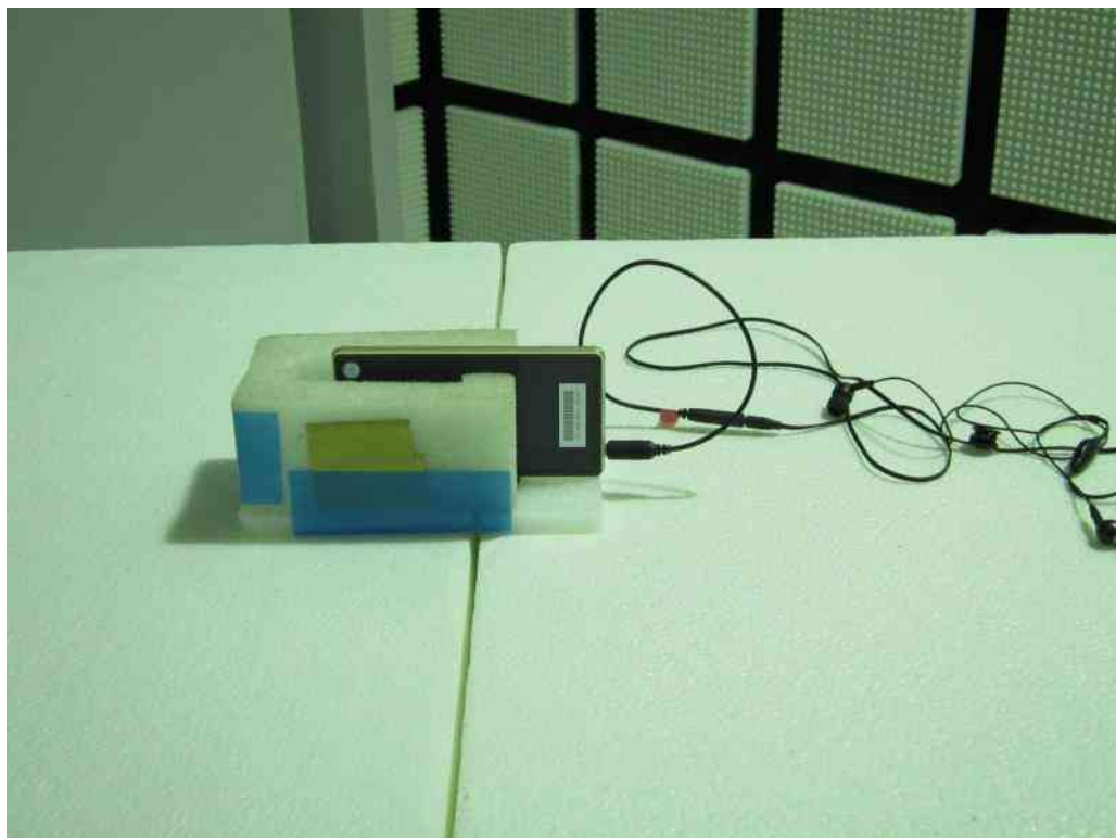
– Y-axis –