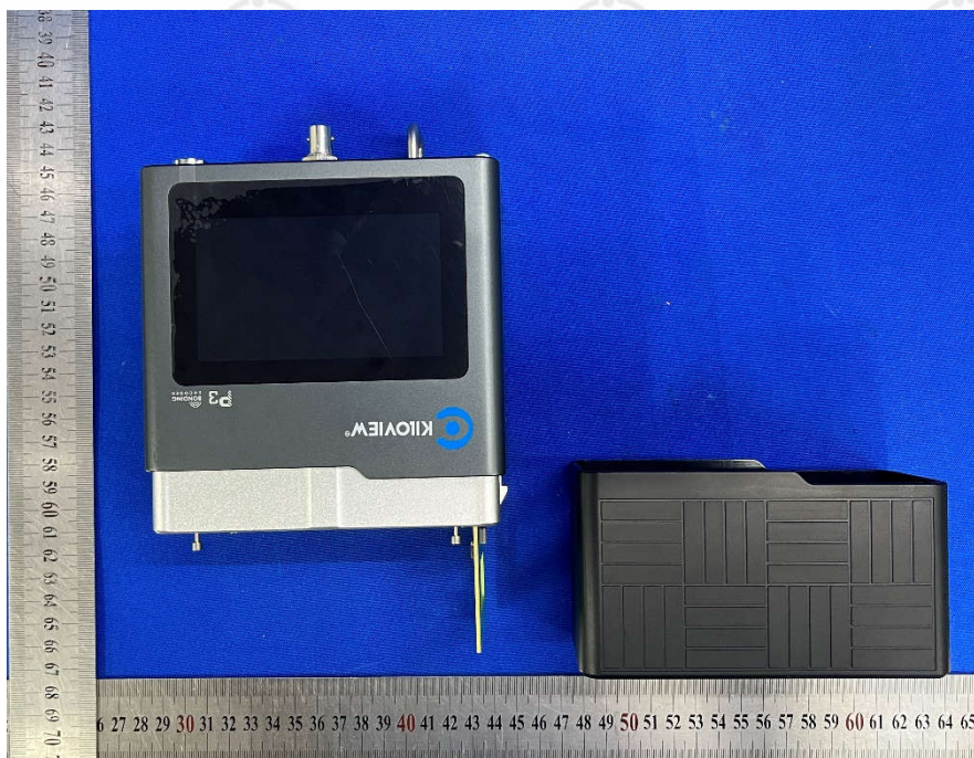
View of Product-08