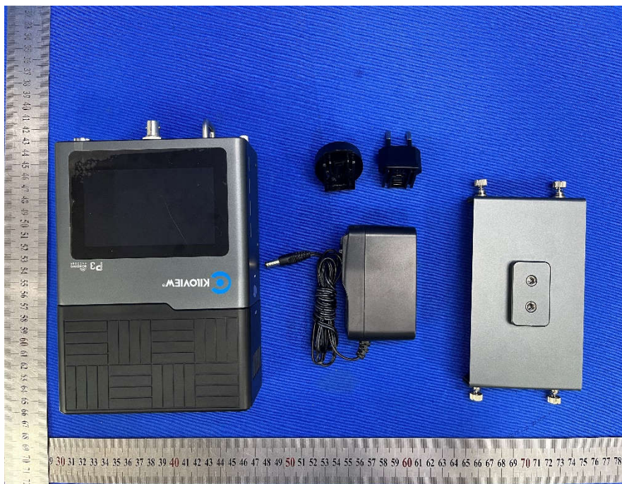
View of Product-01