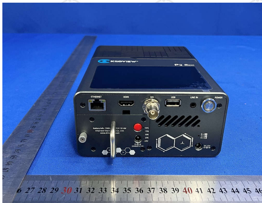
View of Product-04