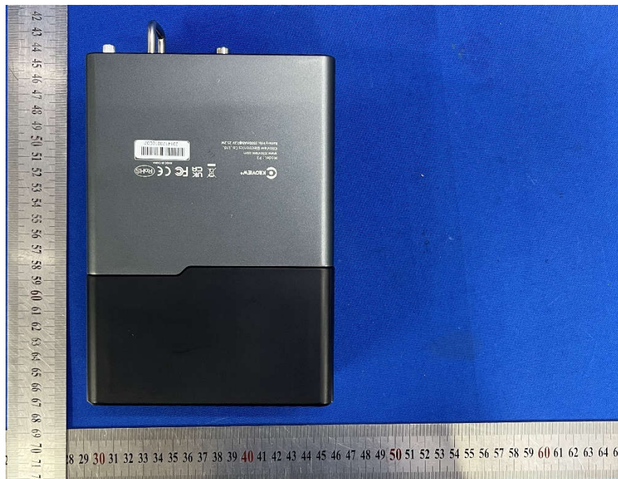
View of Product-03