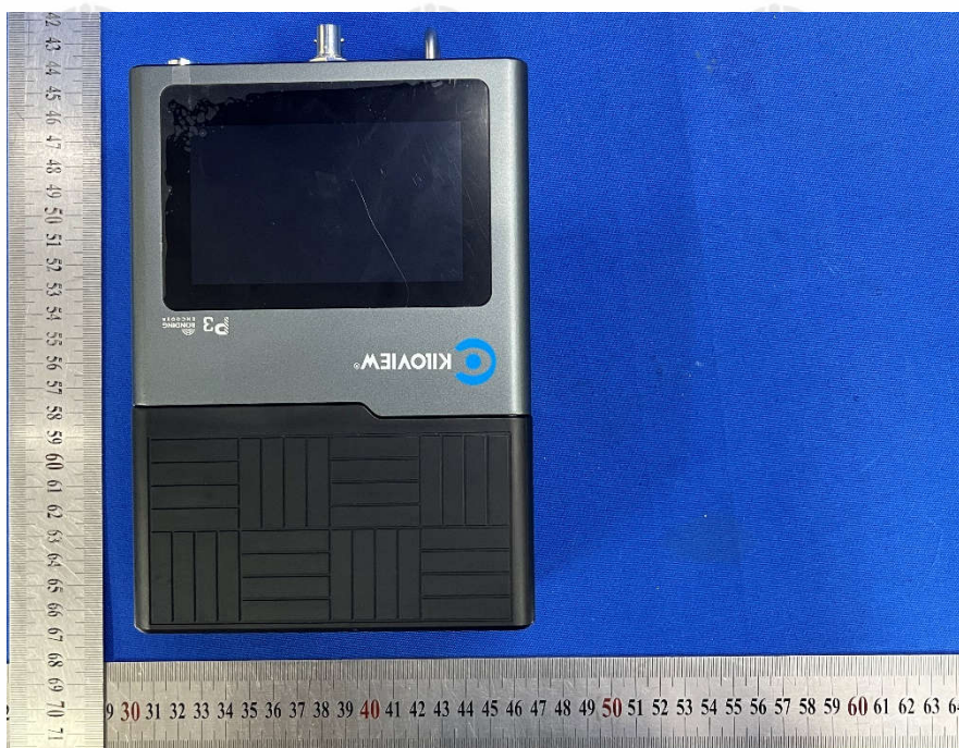
View of Product-02