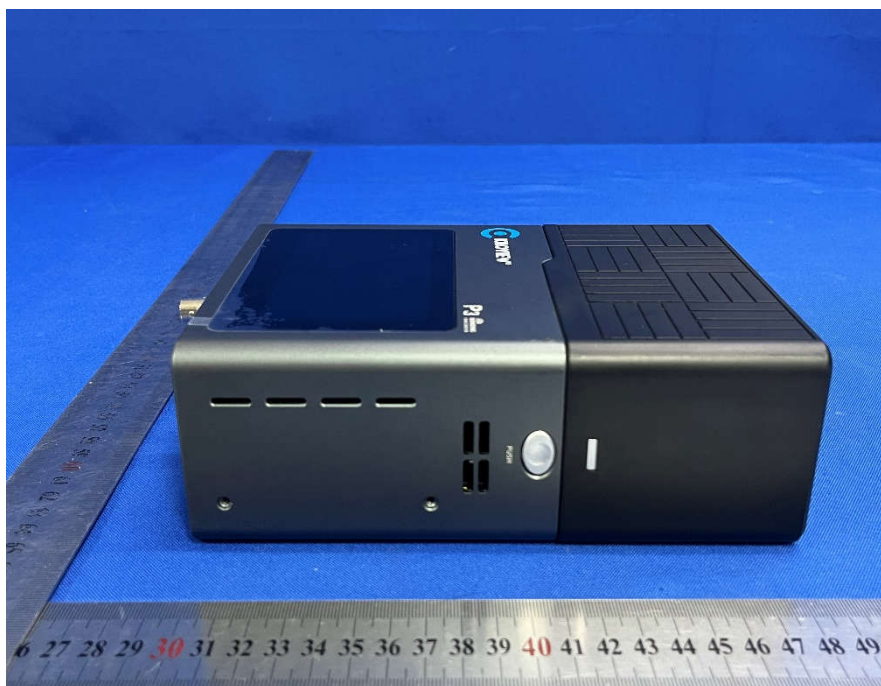
View of Product-07