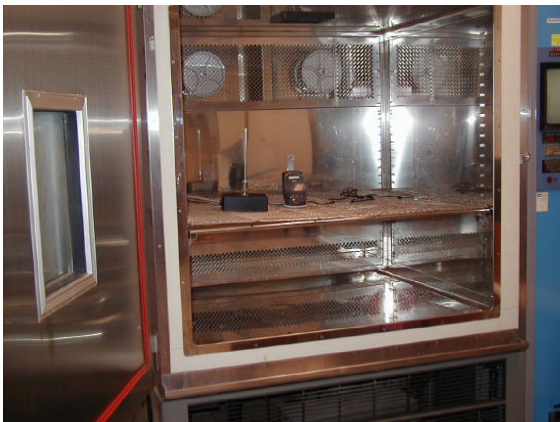
Temperature test chamber