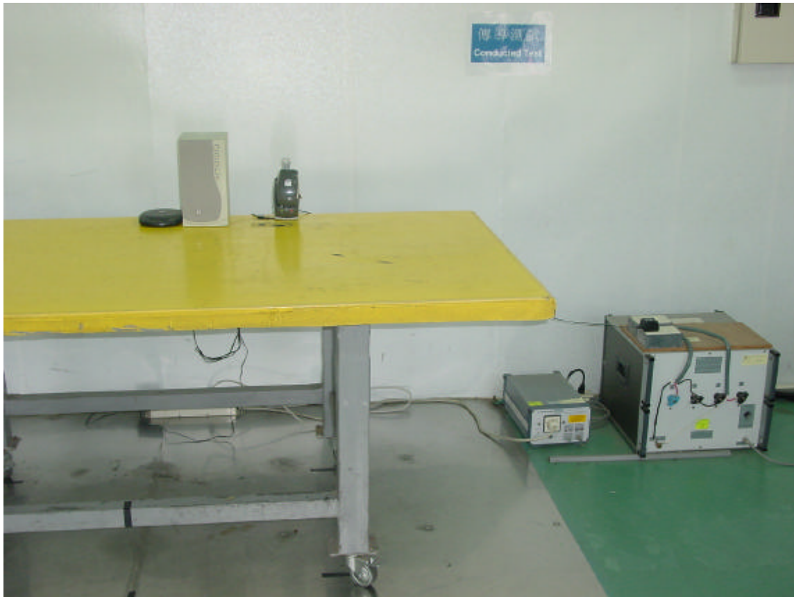
Conducted (Charge Mode)