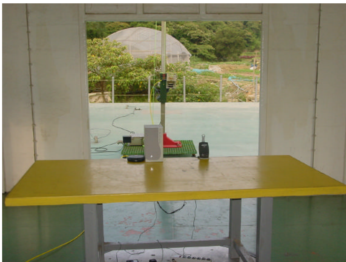
Radiated (1000MHz above)