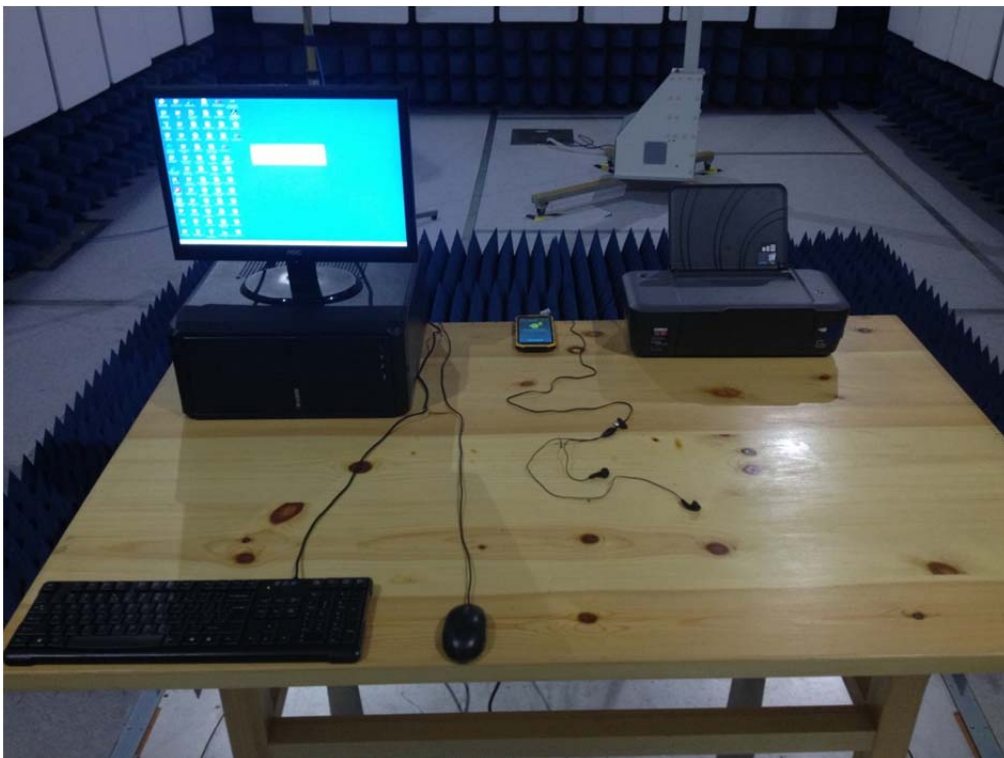
THE FRONT OF TEST PHOTO (THE USB TEST MODE)