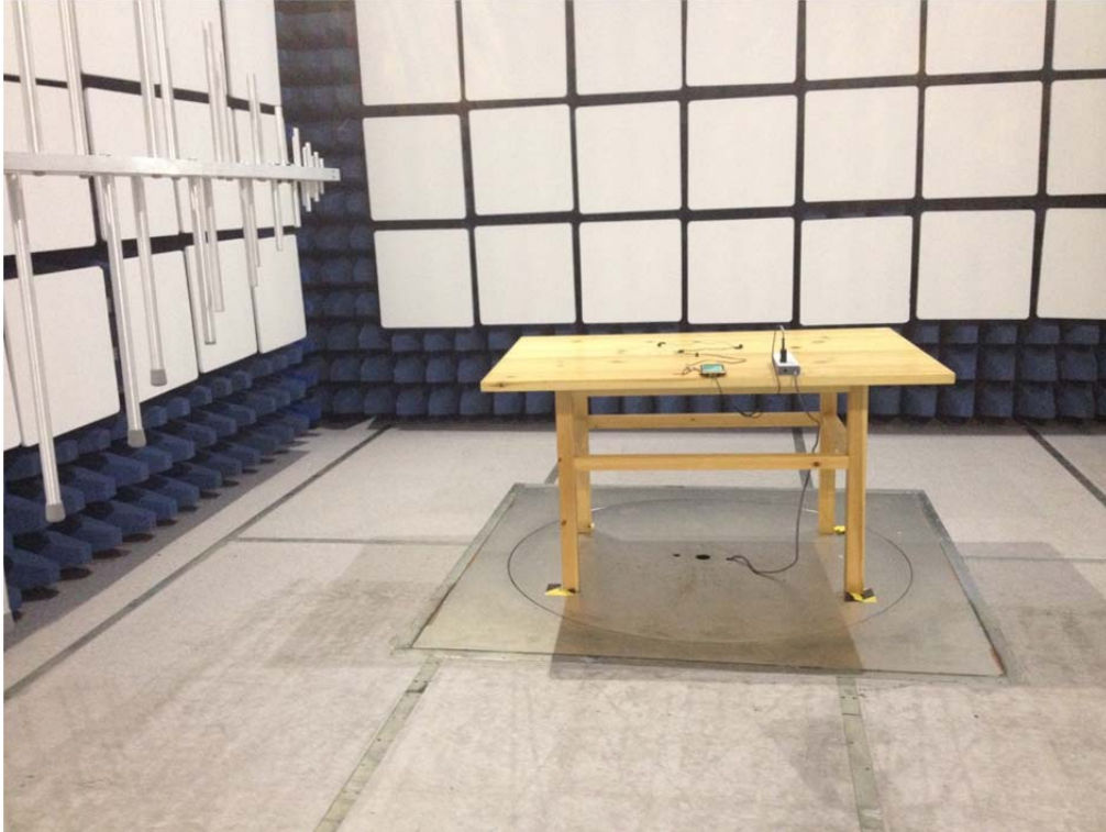
30MHz-1GHz (THE CAMERA TEST MODE)