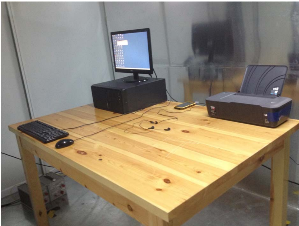
THE FRONT OF TEST PHOTO (THE USB TEST MODE)