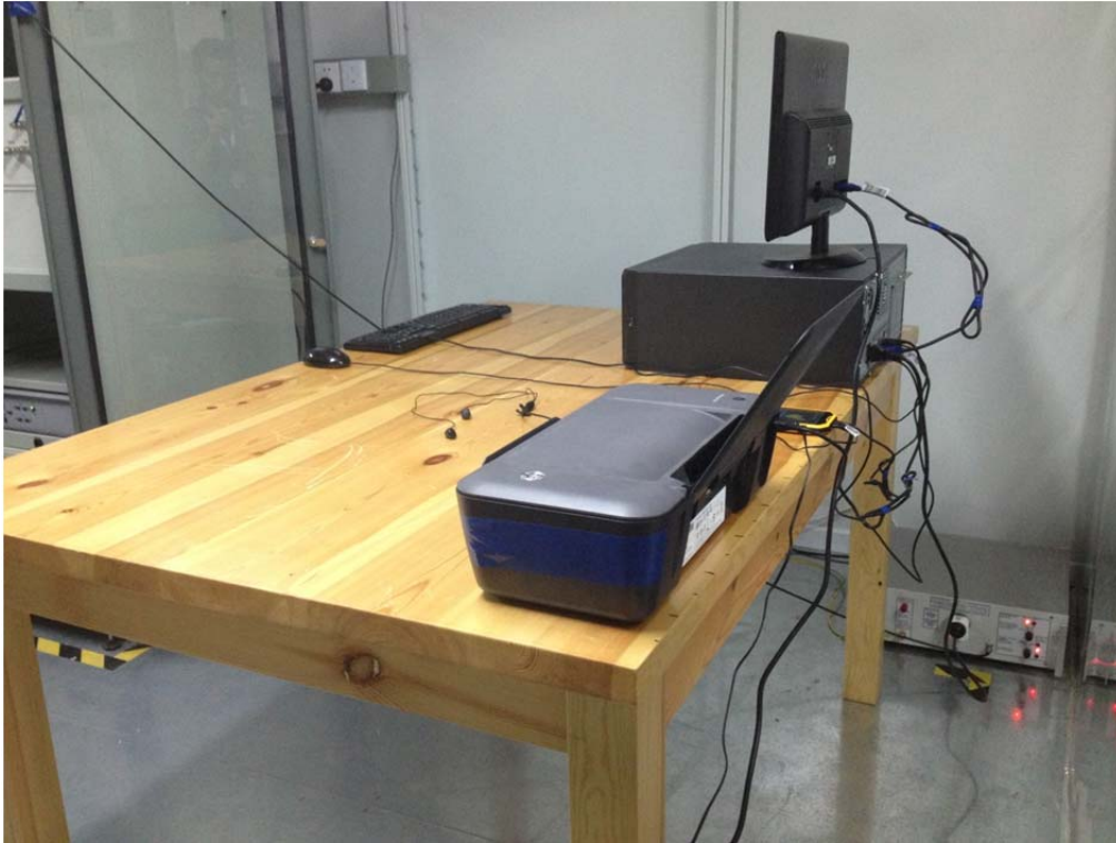
THE BACK OF TEST PHOTO (THE USB TEST MODE)