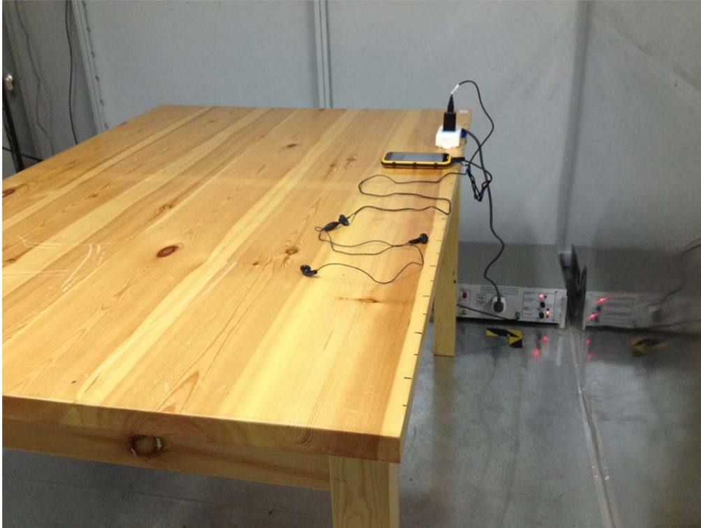
THE CAMERA TEST MODE