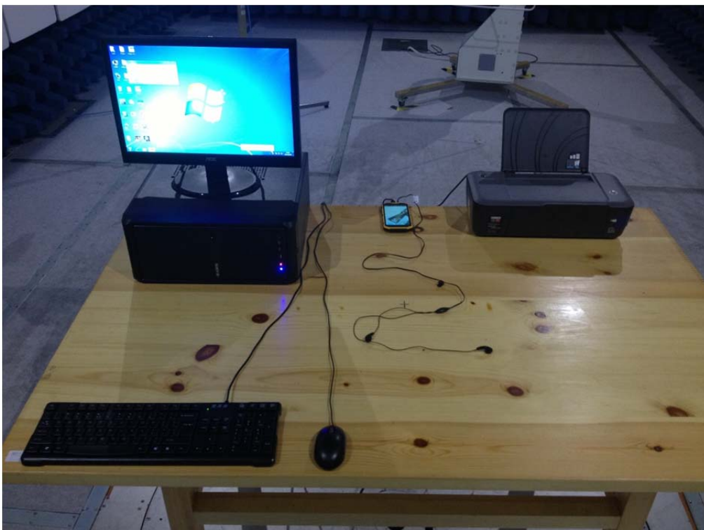
THE FRONT OF THE TEST PHOTO (THE USB TEST MODE)