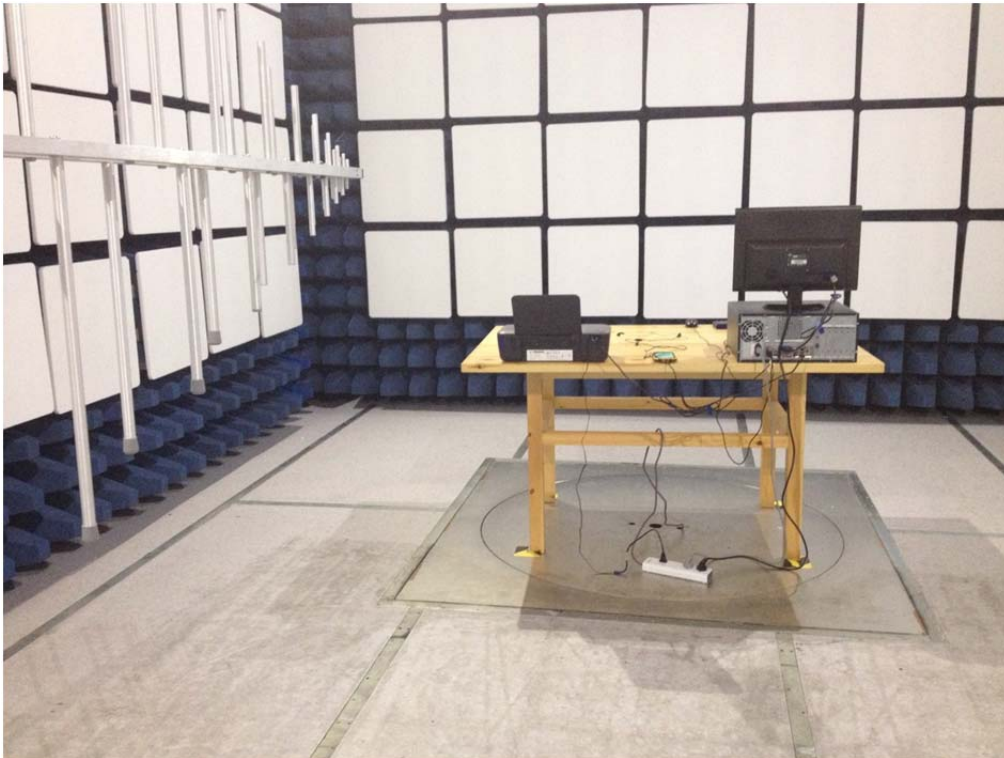
30MHz-1GHz (THE USB TEST MODE)