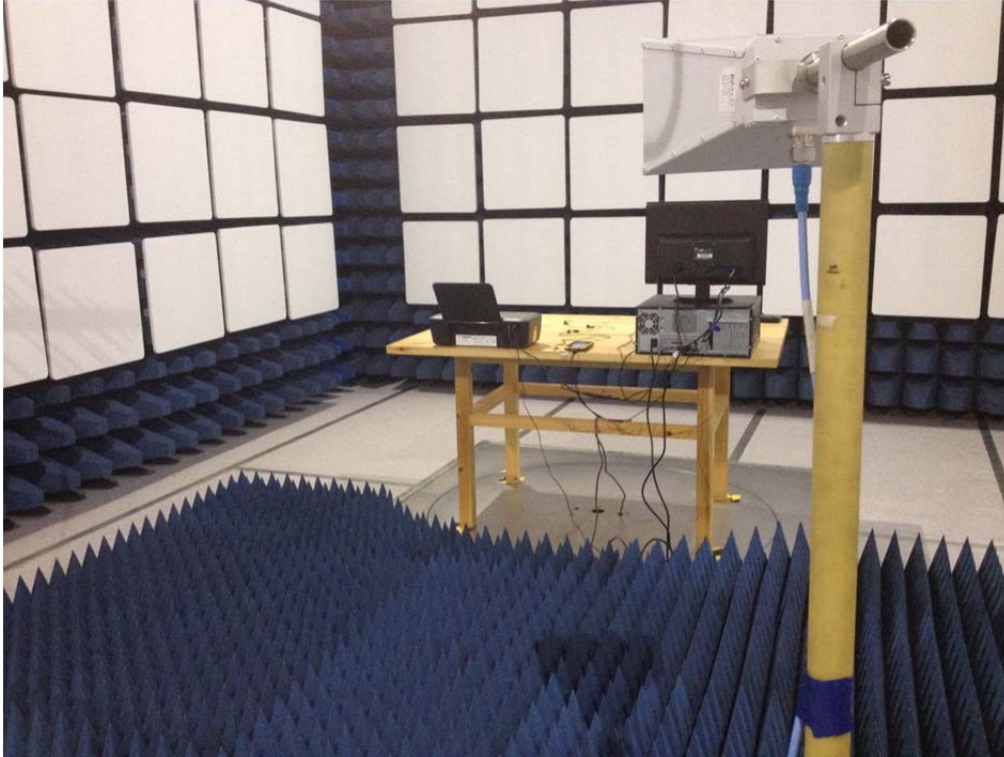
Above 1GHz( THE USB TEST MODE)