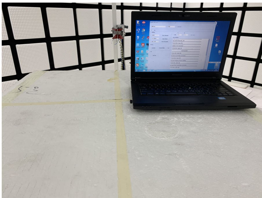
Radiated spurious emission Test Setup-2 (Above 1GHz)