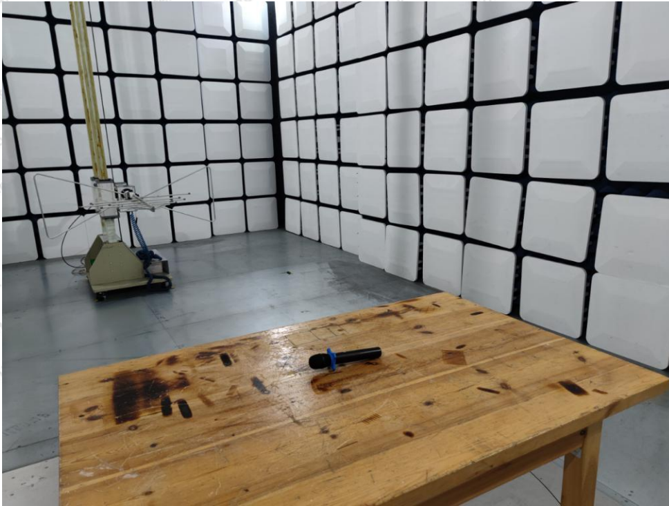
Photo of Radiation Emission Test