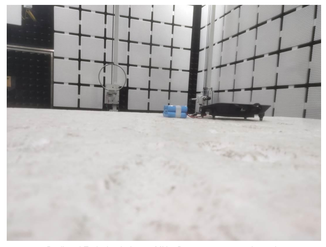
Radiated Emission below 30MHz- Battery power supply mode