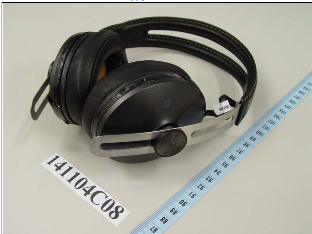
Model: M2 AEBT

The minimum test separation distance is determined by the smallest distance from the antenna and radiating structures or outer surface of the device, according to the host form factor, exposure conditions and platform requirements, to any part of the body or extremity of a user or bystander. (See below figure)