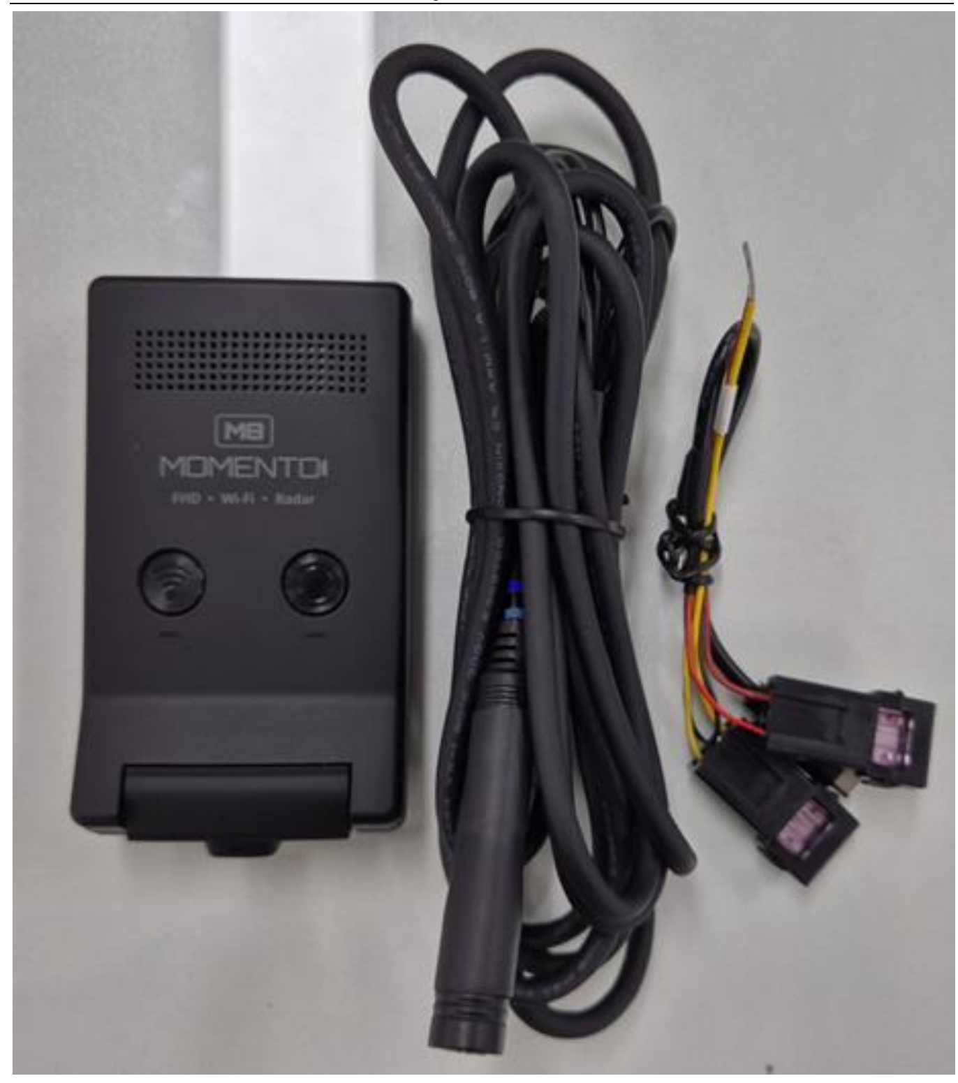
MD-8000 V526 processor, DDR3*1, front camera only