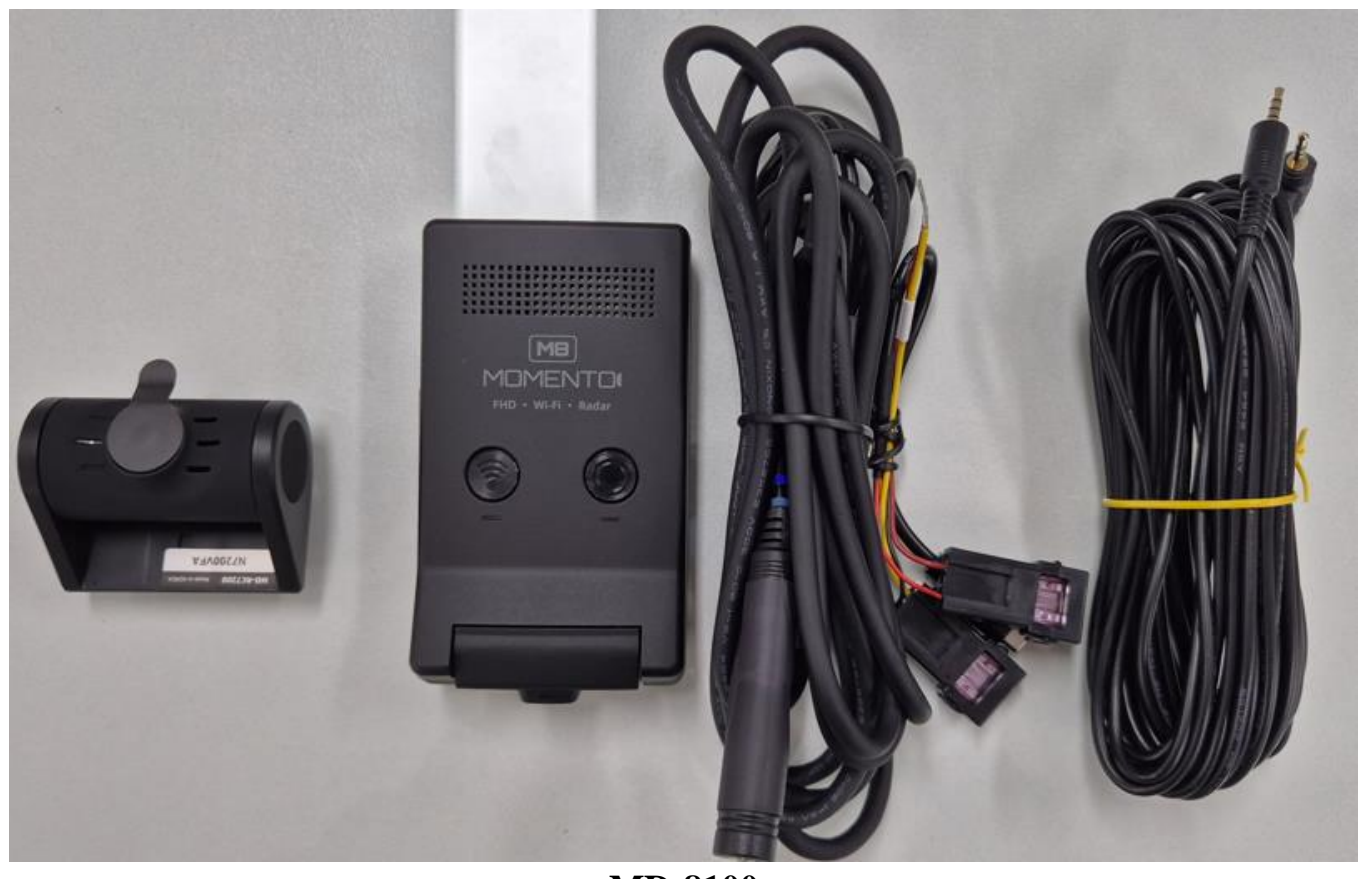
MD-8100 V526 processor, DDR3*1, front camera+rear camera