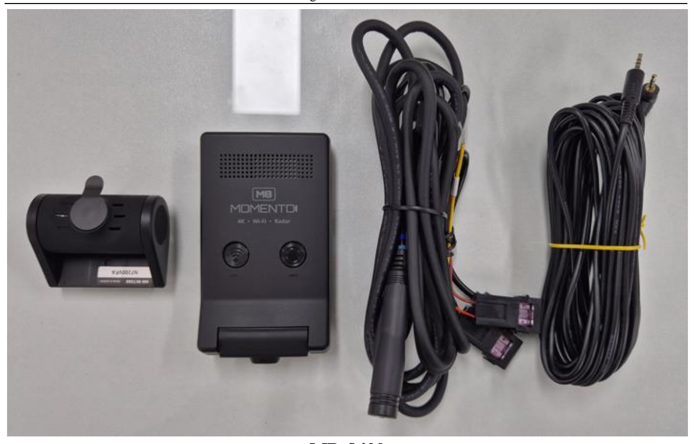
MD-8400 V536 processor, DDR3*2, front camera+rear camera