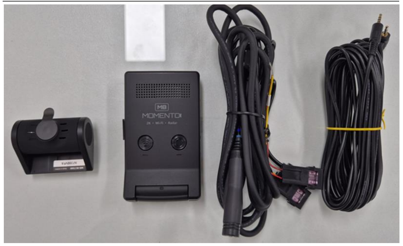
MD-8200 V536 processor, DDR3*2, front camera+rear camera