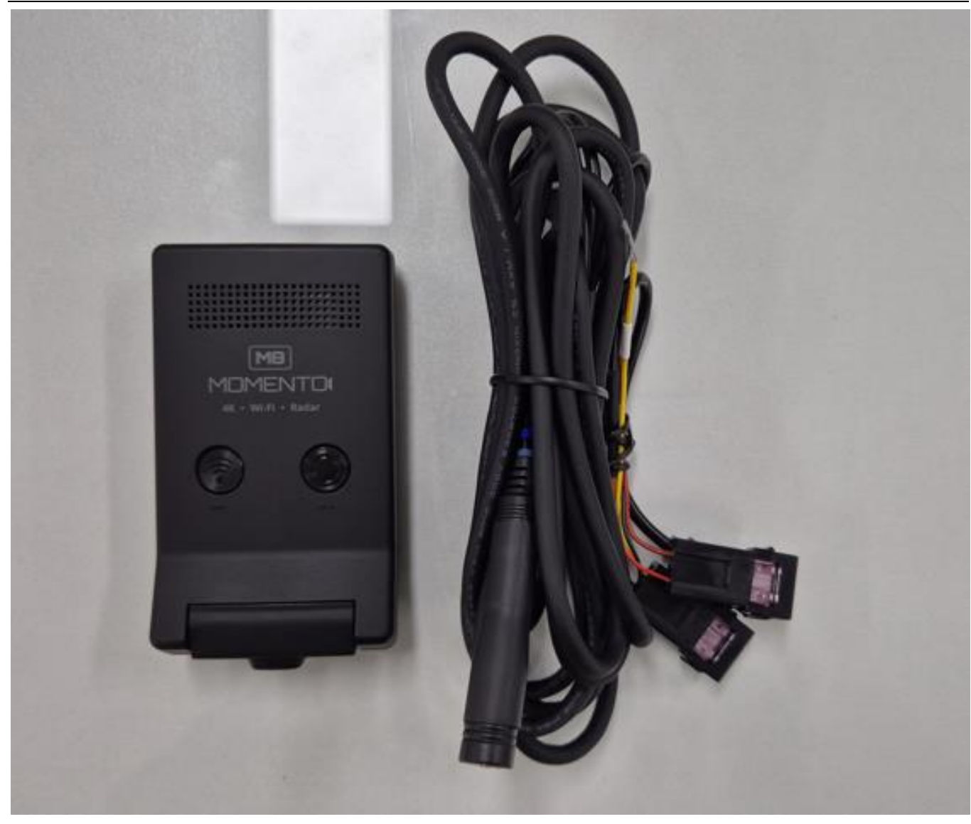
FTX-DC4000 V536 processor, DDR3*2, front camera only