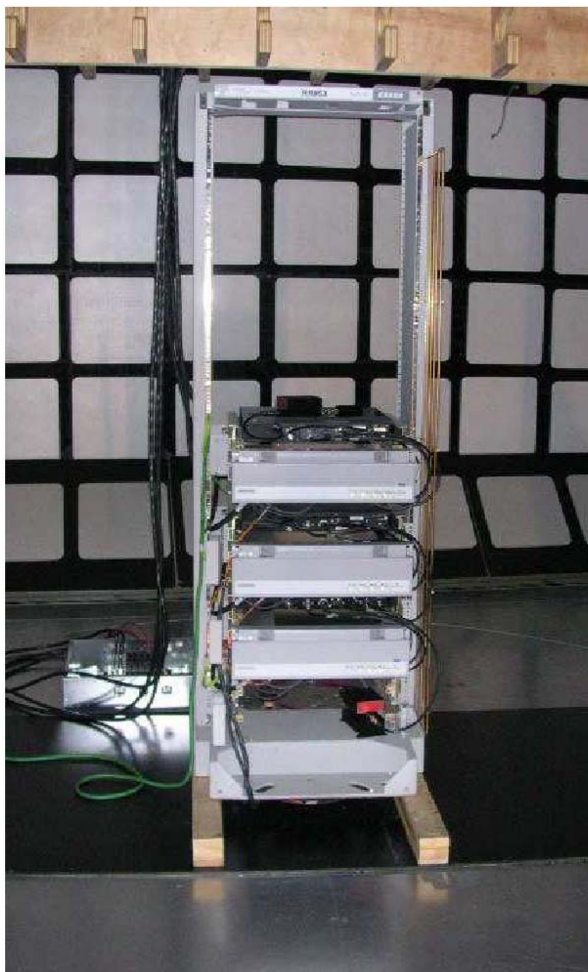
Test setup for the Radiated Emission

This document contains Proprietary information of Nortel Networks. This information is considered to be confidential and should be treated appropriately.