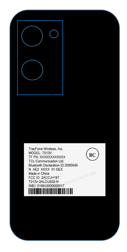
T513V Label and Placement

TracFone Wireless, Inc. MODEL: T513V TF PN: XXXXXXXXXXXXX