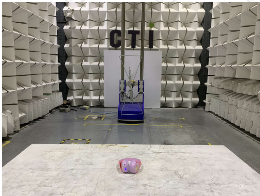
Radiated spurious emission Test Setup-1 (Below 1GHz)