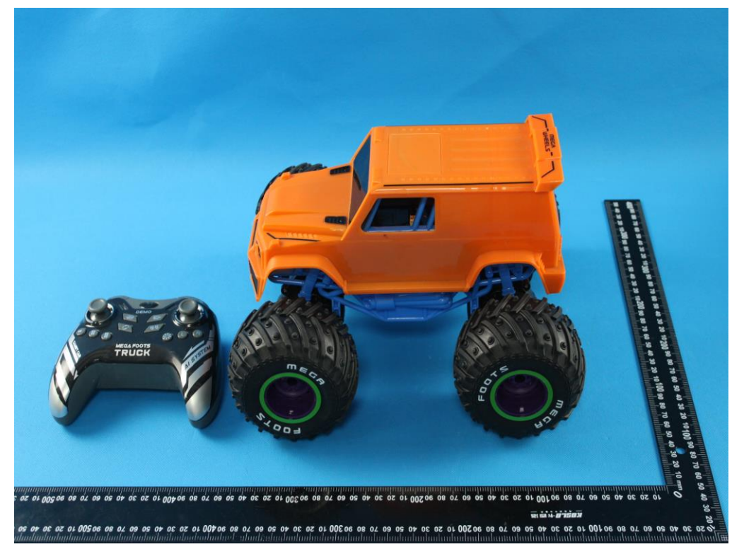
All VIEW OF EUT-6