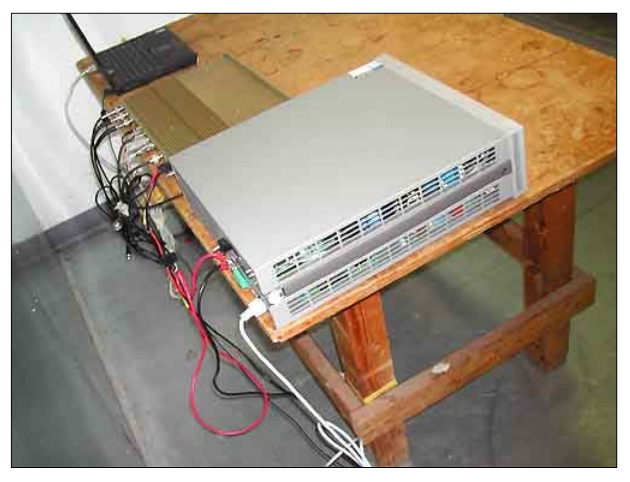
Mains Conducted Emissions - Back View