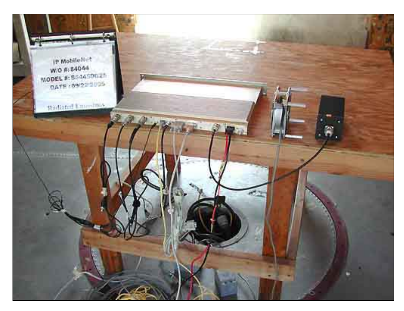
Radiated Emissions - Back View