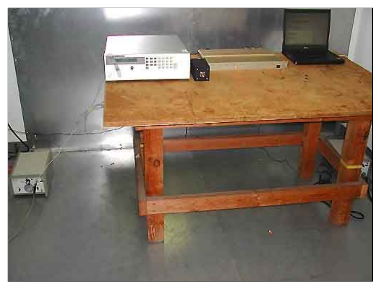
Mains Conducted Emissions - Front View