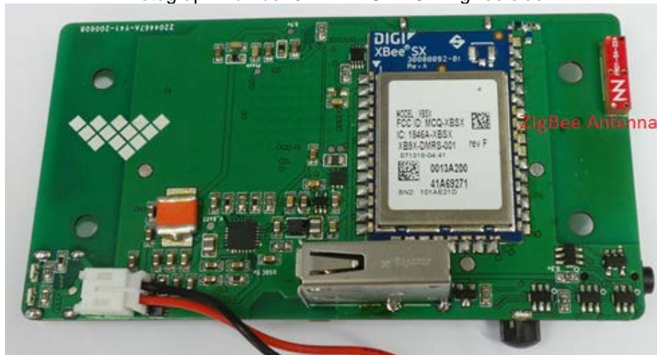
Photograph Number 02. DUT WWAN side