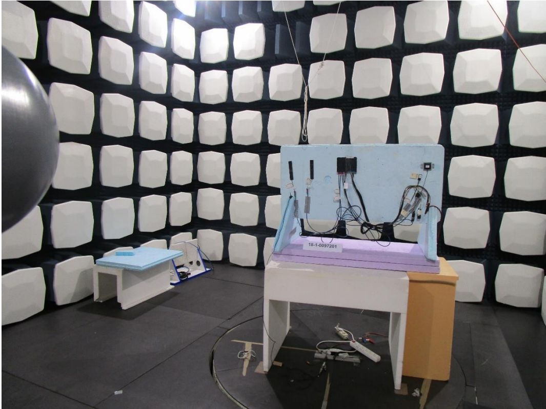
Photograph 1: EUT standing: overall view