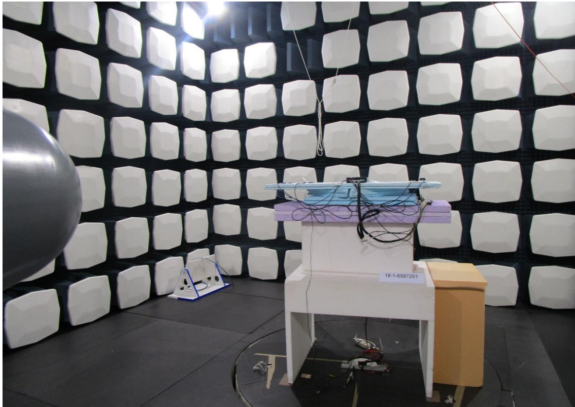
Photograph 3: EUT laying: overall view