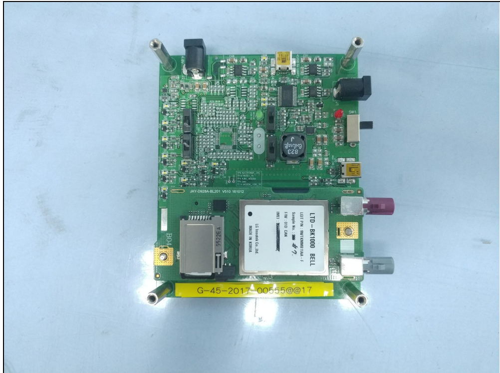
Bottom view of EUT with Jigboard