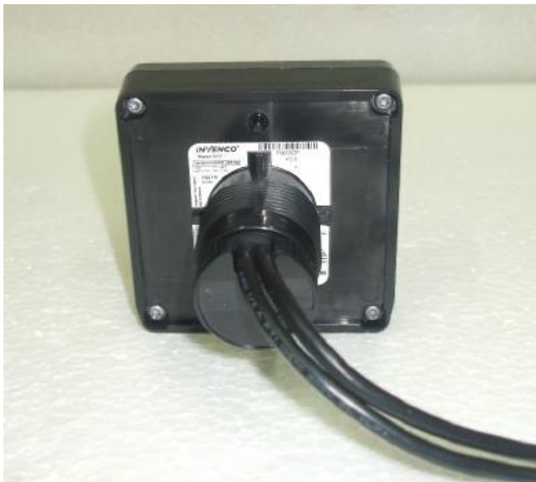
Figure 3 Assembled unit viewed from the back