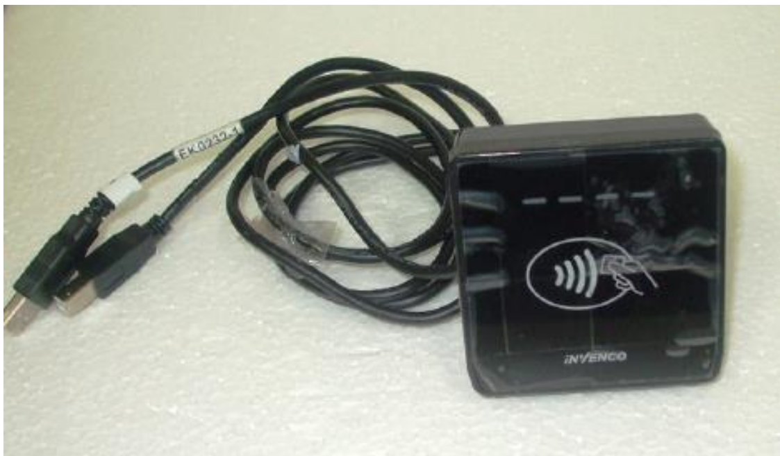
Figure 1 Assembled unit viewed from front