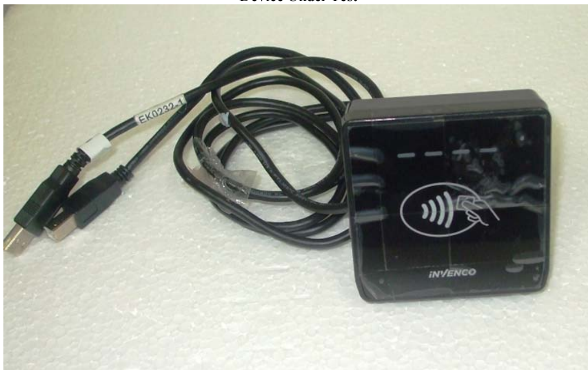
Device Under Test