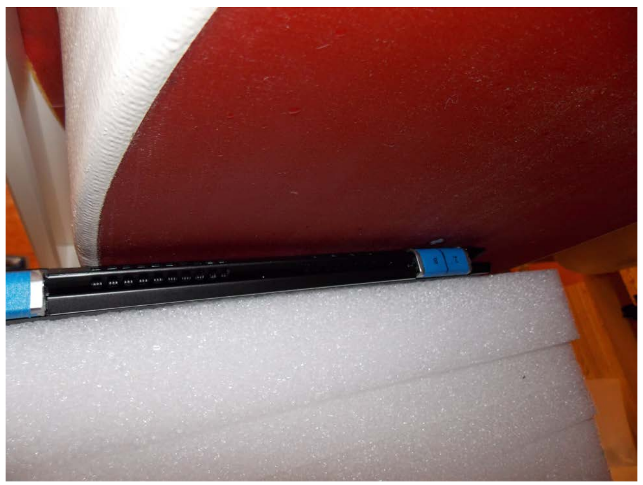
Test Position Tablet Back 0 mm Gap