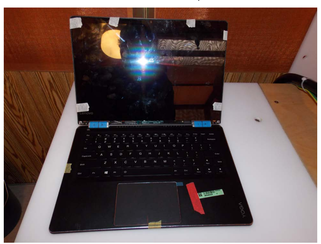
Front of Device Laptop Mode