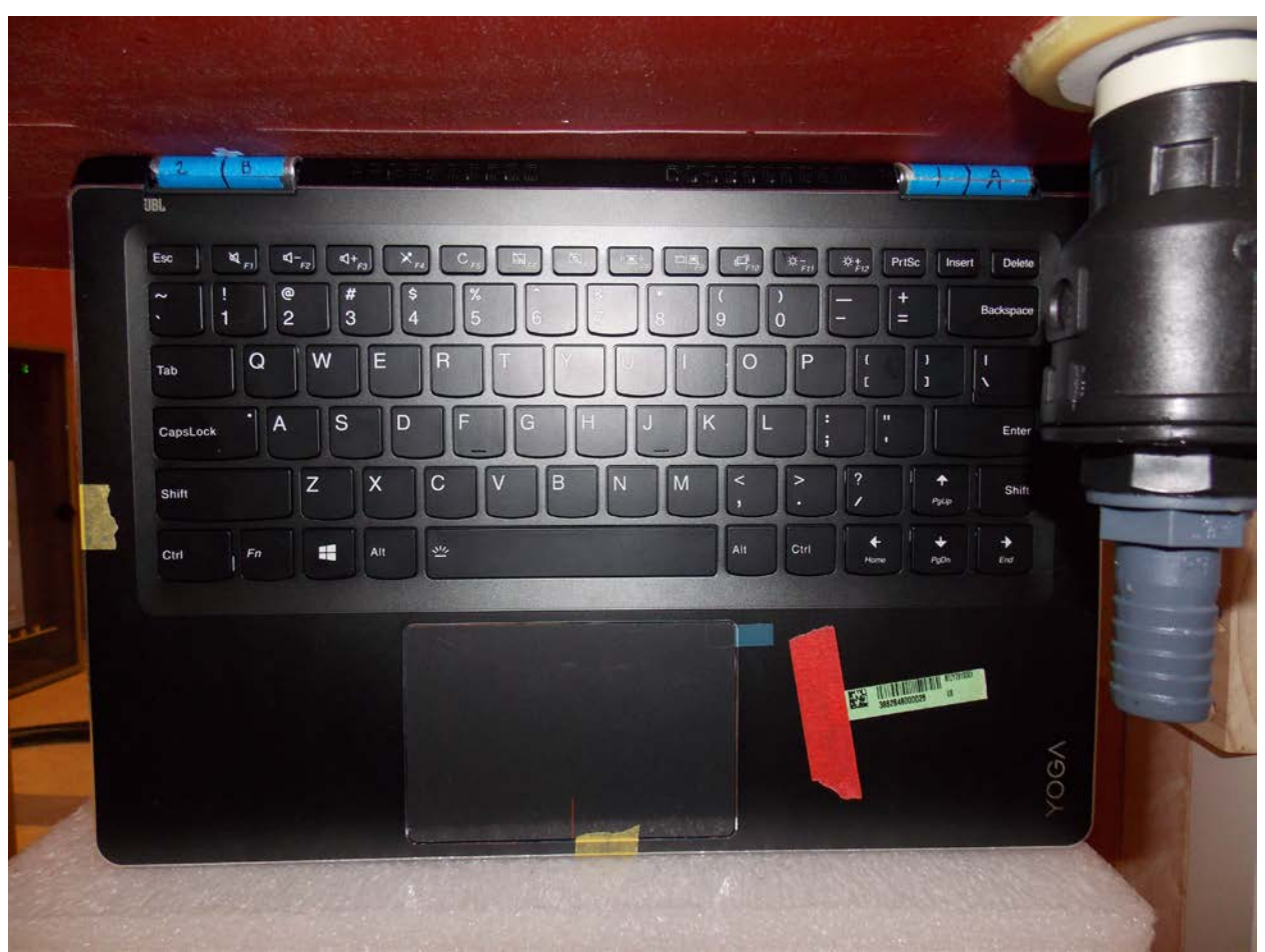
Test Position Front Edge 0 mm Gap