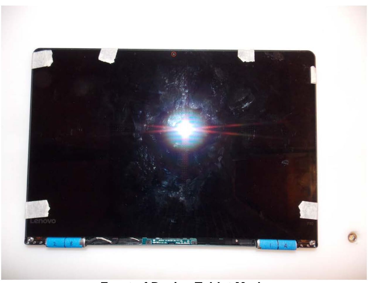
Front of Device Tablet Mode