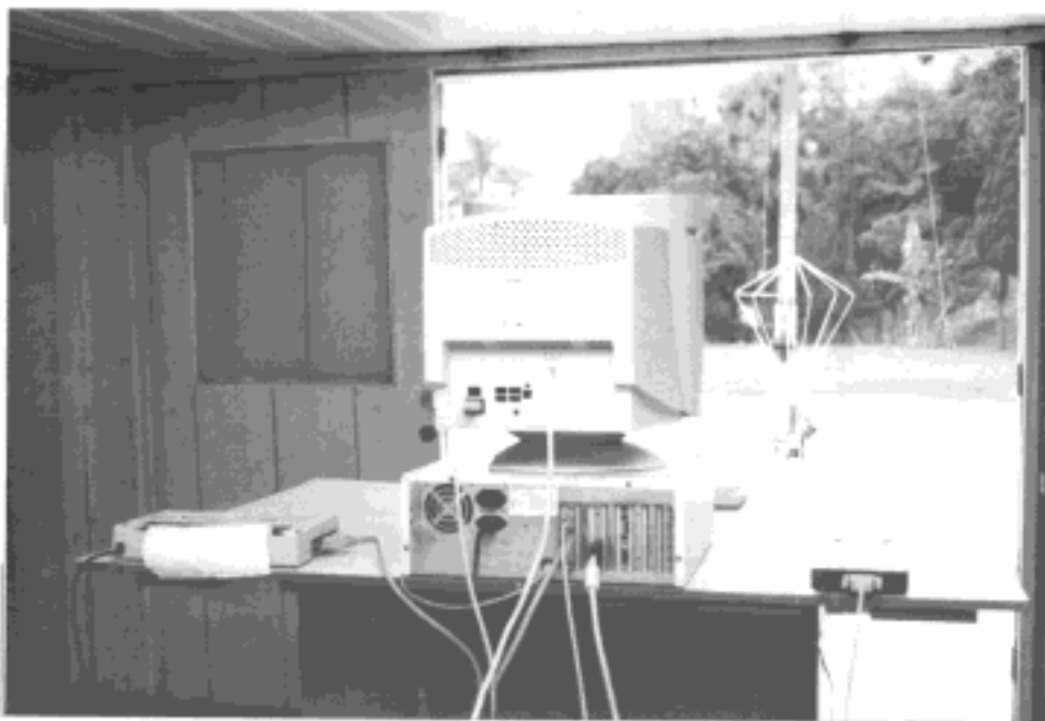
Back View of Radiated Measurement