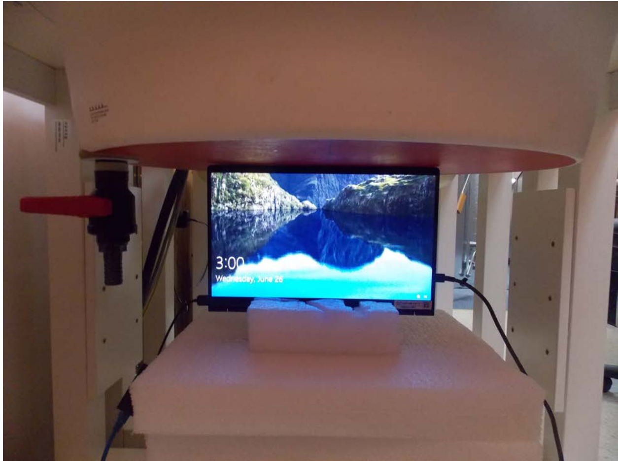
Test Position Top 0 mm Gap

Note: All cables are removed prior to testing.