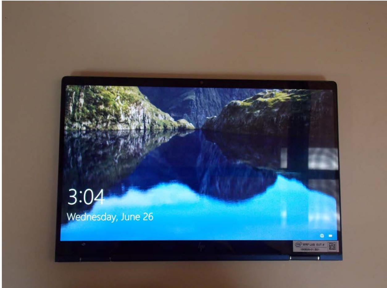
Front of Device Tablet Mode