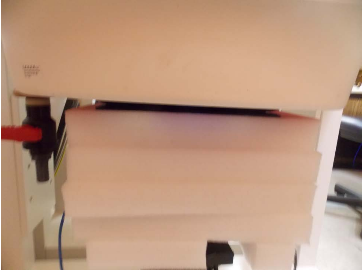
Test Position Back 0 mm Gap

Note: All cables are removed prior to testing.