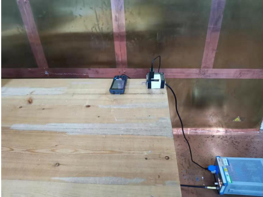
Picture3: Conducted Emissions